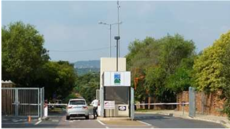
Figure 1: Entry to an enclosed neighbourhood in Tshwane

The roads within enclosed neighbourhoods were previously or in most cases still is public domain, depending on the model used: a public or private approach. Municipalities may support neither of these, only one, or allow both approaches. The implications are very different. In the public approach, the municipality is responsible for maintenance as the roads, parks, and sidewalks are still publically owned and consequently access cannot be denied into the area. However, in private areas, residents are responsible for the maintenance, while being able to restrict access. The implications for accessibility are therefore dependant on the model used. According to the constitution of South Africa, it is the right of all people to have access to and free movement within all public space. Therefore, if the enclosed area stays under public control through the utilisation of the public approach, all people have the right to enter (Landman 2007; Landman and Badenhorst 2014).