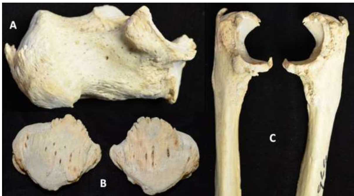
Figure 2. Extraspinal manifestation sometimes incorporated into the diagnosis of DISH. A) Image showing ossification on the calcaneus (insertion of M. triceps surae ), B) on the patellae (insertion of M. quadratus femoris ), and C) at the proximal ulnae (insertion of M. triceps brachii ).

unknown, some causative agents have been suggested, such as diabetes mellitus, obesity, age, hyperuricemia, hypertension, hyperinsulinemia and elevated insulin-like growth factor (Cassim et al., 1990; Rogers and Waldron, 1995; Rogers and Waldron, 2001; Mader and Lavi, 2009; Reuven Mader et al., 2009; Roberts and Manchester, 2010). A familial or genetic predisposition for the disease has been proposed and explored with little success in finding a definitive answer (Pappone et al., 1996; Sarzi-Puttini and Atzeni, 2004; Gorman, 2005). The manifestations of this disease are not limited to the spine alone, with ossification of tendon, ligament and capsule insertions (entheses) occurring at multiple peripheral sites (Fig. 2), a concomitant feature of the spinal disease (Resnick et al., 1975; Resnick and Niwayama, 1988; Rogers and Waldron, 2001; Mader et al., 2009; Roberts and Manchester, 2010). Extraspinal manifestations have been frequently noted (bilaterally) in the calcanea, patellae, ulnae and ossa coxae (Rogers and Waldron, 1995).