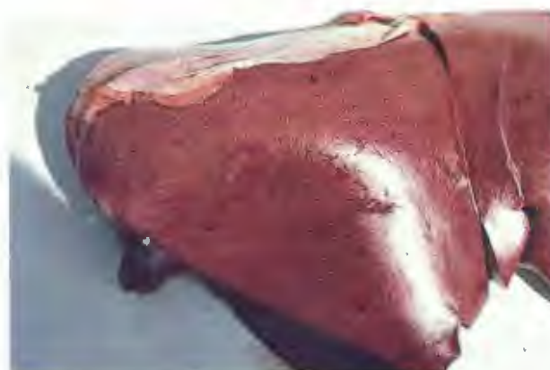
FIG. 7 Yellowish-brown liver with accentuated lobulation and a few small haemorrhages of Sheep 2