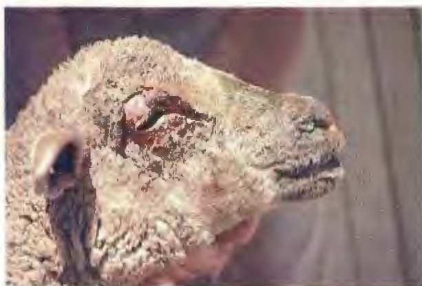
FIG. 5 Sheep from field outbreak (Sheep 8) 9 days after initial signs of photosensitivity were seen