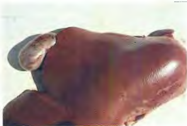
FIG. 6 Pale-brown, swollen liver with disseminated haemorrhages of Sheep 1