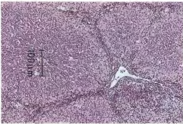
FIG. 9 Accentuated lobulation caused by peripheral haemorrhage and prominent bile duct proliferation in the liver of Sheep 2