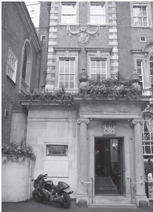
Figure 3: The building at Park Place, St. James's, London, where Fagan stayed