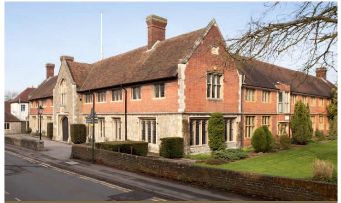
One of the historic buildings at Wye Agricultural College (University of London), founded in 1894