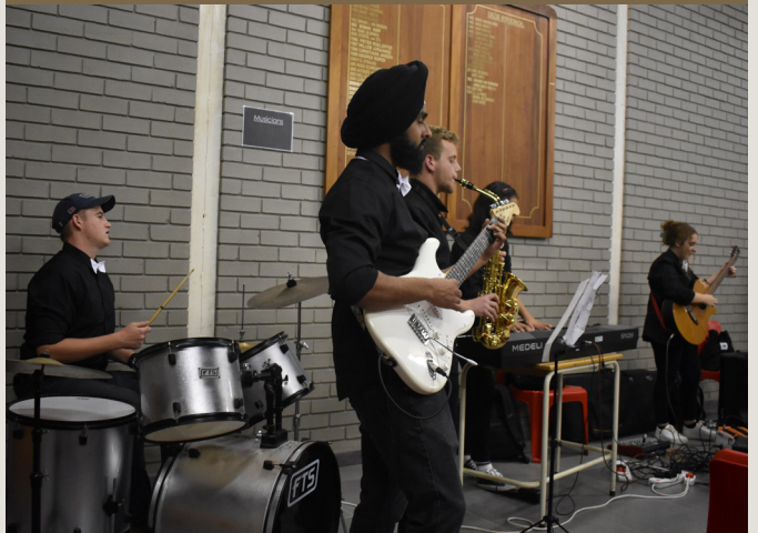
The band for the 2023 Step It Up showcase