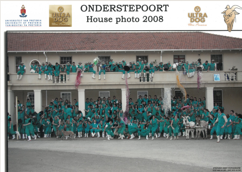
ONDERSTEPSPOORT House photo 2008

Water bombing while taking the 'family photo' in front of Old Res started in late 2000s