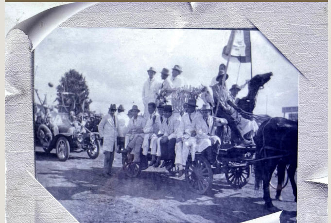
Rag parade - An Onderstepoort float from circa 1920s with the characteristic veterinary theme