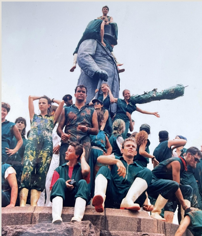
Each year the end of the Rag parade was concluded by the vet students climbing on top of the Paul Kruger statue on Church Square