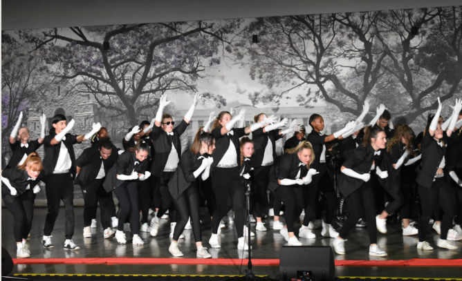
Step It Up has replaced the annual Serrie competition - the 2023 group in action