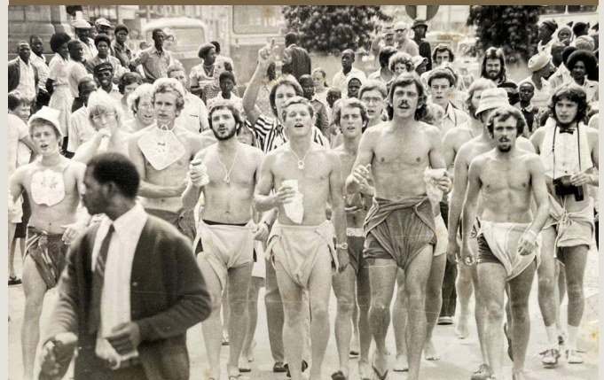
The 1977 RAG Nappy Parade