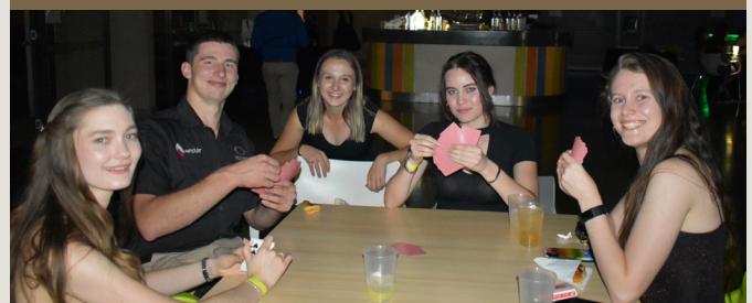
A Mafia revival evening in 2023