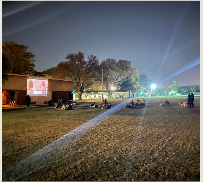
Easy Company started the tradition of watching movies projected onto the side of a building