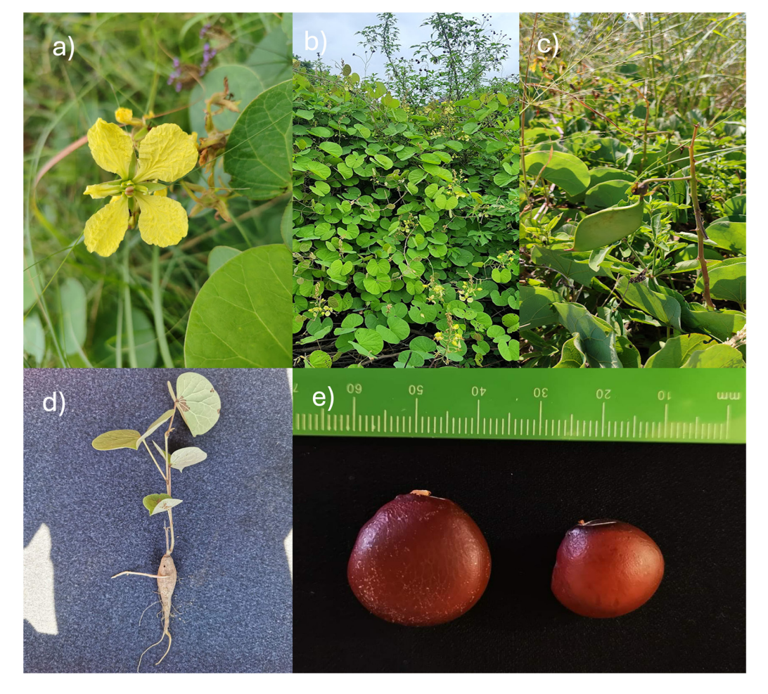
Figure 1. Flower ( a ), leaves ( b ), pods ( c ), tuber ( d ), and seeds ( e ) of Tylosema fassoglense . Note: In panel ( e ) Tylosema fassoglense seeds are in the left-hand side and Tylosema esculentum seeds on the right-hand side.

phylum—Streptophyta [15]. It has notable intraspecific morphological variation [14], as well as longer vines, longer functional tendrils, rusty pubescence on young growths and on the veins of leaves, longer petioles, shallowly bilobed leaves, and larger, flatter fruit pods that are distinctly woody compared to the better studied Tylosema esculentum [14]. Tylosema fassoglense is also characterized by a large underground tuber that has high water storage and retention capacity [14]. Figure 1 shows different parts of Tylosema fassoglense .