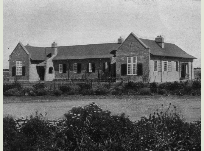
First hostel at Onderstepoort Veterinary Research Laboratory (built in 1908 and used as a student residence from 1922 to 1924)