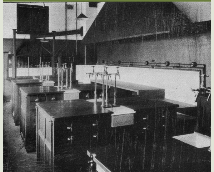
Students' laboratory modelled after the laboratory at the Veterinary Bacteriology Institute, Bern University, Switzerland c. 1908.