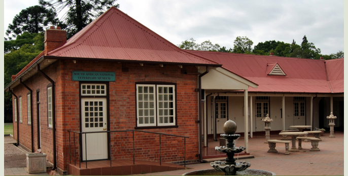
SANVM. Today the 'Old Hostel' houses the South African National Veterinary Museum and OVR Archives.