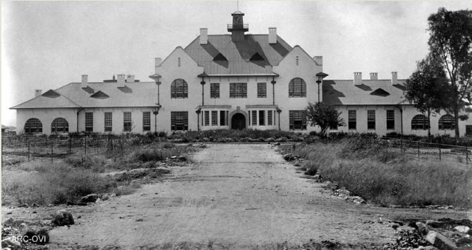
Old Main Building, Onderstepoort Bacteriological Laboratory, c. 1908.