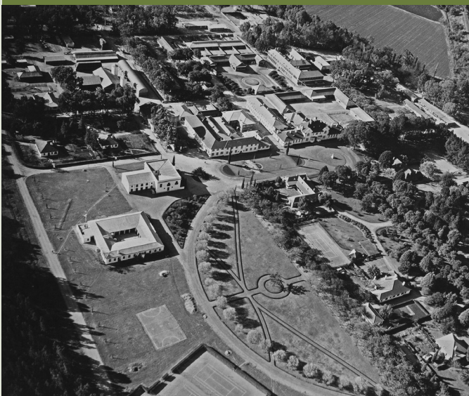
Onderstepoort Veterinary Research Laboratory complex with first hostel in the centre of the picture, c. 1945 - 1950s.