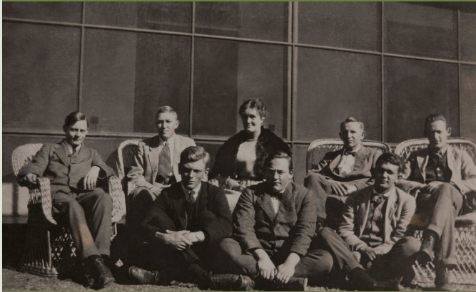
The first Onderstepoort veterinary students with the house mother in front of Theiler's residence at Onderstepoort, c. 1923.