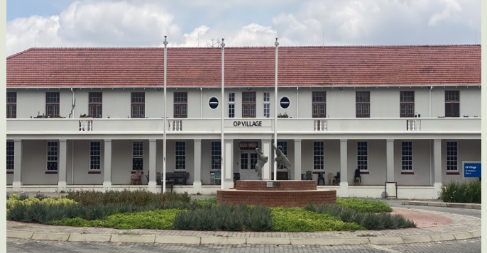
'Old Res' at OP Village nowadays.