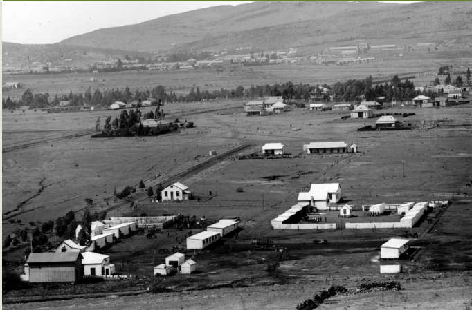
Daspoort Bacteriological Laboratory (left) and Rinderpest Station (right) with Pretoria in the background, c. 1906. Today this is the location of the Tshwane Market.