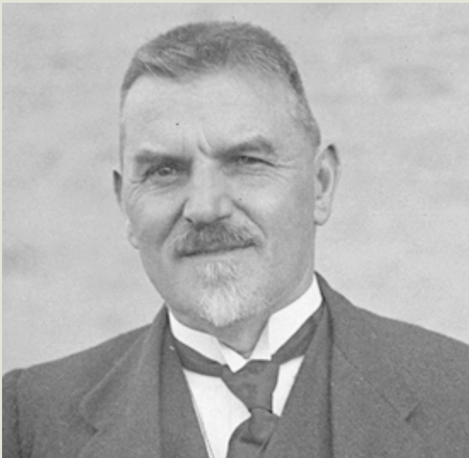
Sir Arnold Theiler, c. 1920 (1867-1936), Director of Onderstepoort Veterinary Research Laboratory (1908-1927) and first Dean of the Faculty of Veterinary Science (1920-1927).