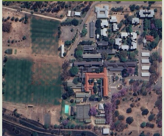
Aerial view of the Onderstepoort Veterinary Faculty student residences in 2023.