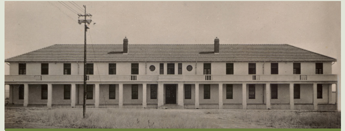
Old Res in 1924, then the new residence for veterinary students at Onderstepoort.