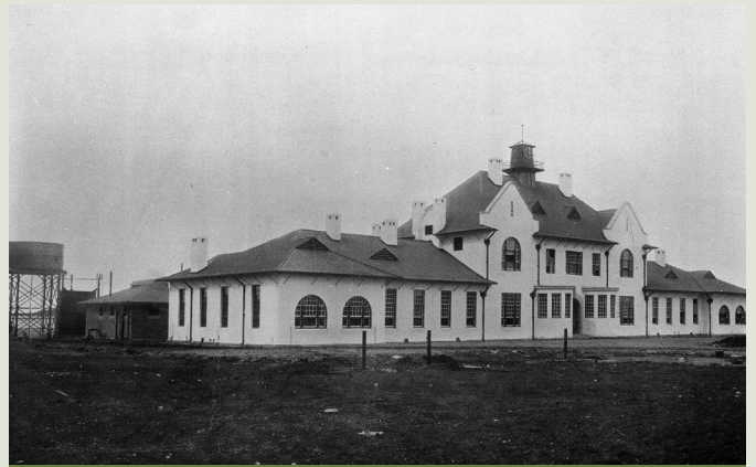
Onderstepoort Bacteriological Laboratory with the auxiliary plant that provided steam and electricity to the north-west of the building, c. 1908.