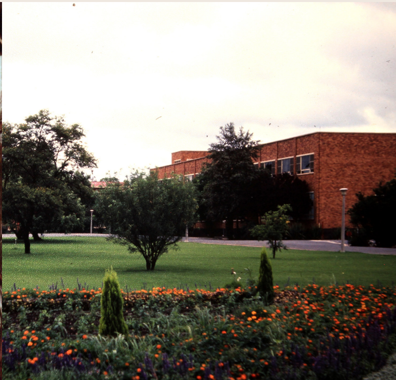
The Anatomy Building, Faculty Veterinary Science, Onderstepoort during the 1970s