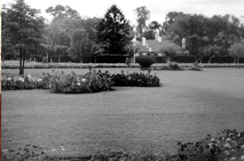
The Onderstepoort Houseparents' house, 1970s