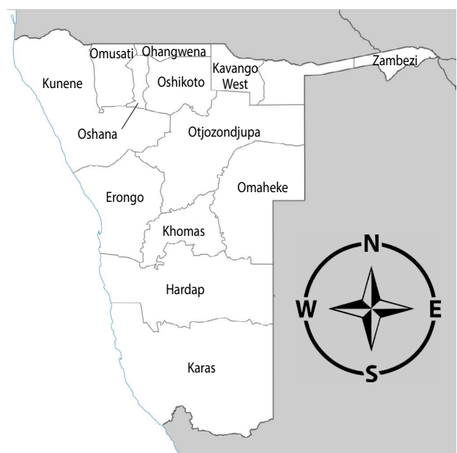
Figure 1: Map of Namibia showing its fourteen regions. The Khomas region is located centrally, as shown on the map. The map was used with permission.

The positive and negative controls were then validated, and ratios of a sample to positive control were interpreted as follows: a ratio of less than 20% was interpreted as negative; a ratio of at least 20% but less than 30% was suspect; a ratio of at least 30%