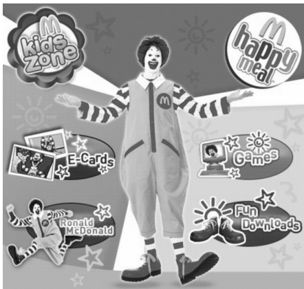
Figure 5: Endorser five – Ronald McDonald (Created endorser)