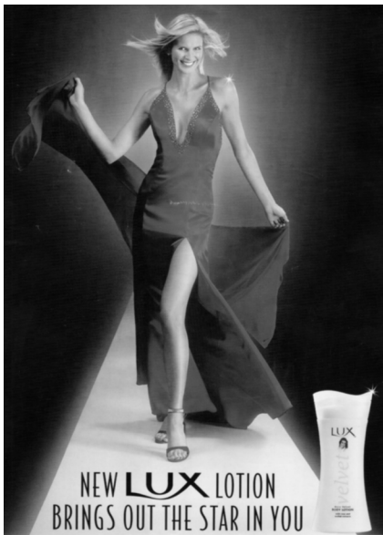
Figure 1: Endorser one – Michelle Mclean (Model and television presenter)