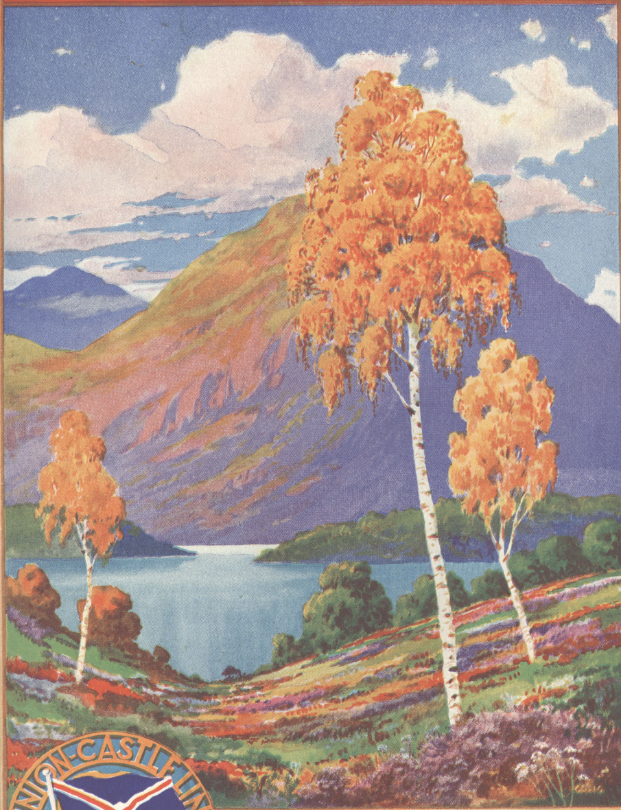
THE TROSSACHS SCOTLAND