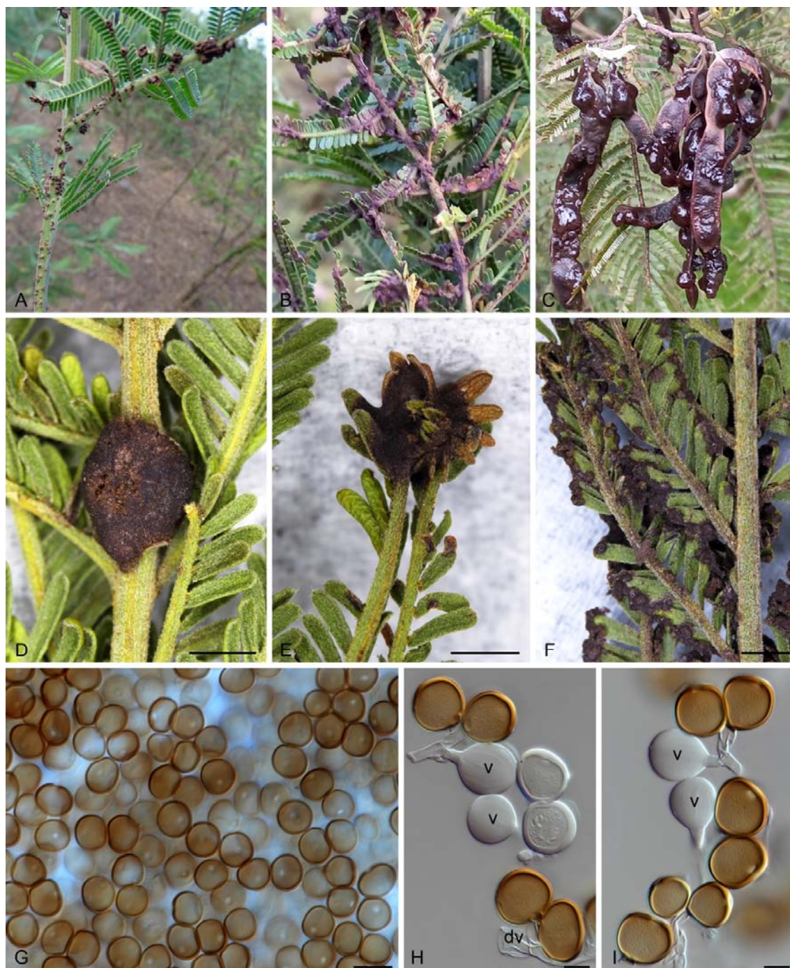
Figure 2. Uromycladium acaciae on Acacia mearnsii . A–C. Trees in the field heavily Infected with the rust and moistened telia on seed pods showing slimy crust ( C ). D–F. Close-up of telia on rachis and pinnules ( D , E : PRU(M) 4531. F : PRU(M) 4530). G. Teliospores (PRU(M) 4530). H, I. Two teliospores borne on a pedice, and inflated (v) and deflated vesicles (dv) underneath the septum (PRU(M) 4531). Scale bars: D–F = 2.5 mm; G = 25 \mu m; H, I = 10 \mu m.