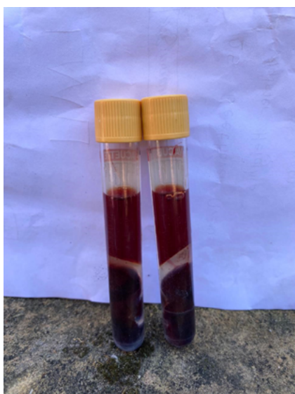
Figure 1: Serum blood samples collected from the black rhino Akhona, on 27 April 2020, while in the holding facilities at Addo Elephant National Park, South Africa; note the haemolysed appearance of the serum

Akhona was very listless and did not respond with the usual excitation when darted with the immobilising agent, although she did break into a sweat without any prior exertion. Her heart rate was 65–75 beats per minute and respiration six to eight breaths per minute. The rectal temperature was 40.5 °C. Her rectum was impacted with dry faecal balls, which were manually removed by means of an enema with medical liquid paraffin and three to four litres of water. To combat dehydration, in addition to the water administered per rectum, one litre of Ringers lactate solution (Fresenius Kabi) and one litre of 5% glucose in saline solution were administered intravenously. As prophylactic treatment for colic, 15 ml flunixin meglumine (15 mg/ml) (Finadyne, Schering-Plough AH), 60 ml procaine benzylpenicillin (150 mg/ml); benzathine benzylpenicillin (115 mg/ml) (Duplocillin, Intervet SA) and 15 ml doramectin (10 mg/ml) (Dectamax, Zoetis) were administered intramuscularly. Blood specimens were collected from the vena brachialis into K3EDTA, SST serum and Sodium Heparin vacutainers