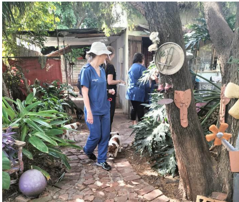
Doing house calls