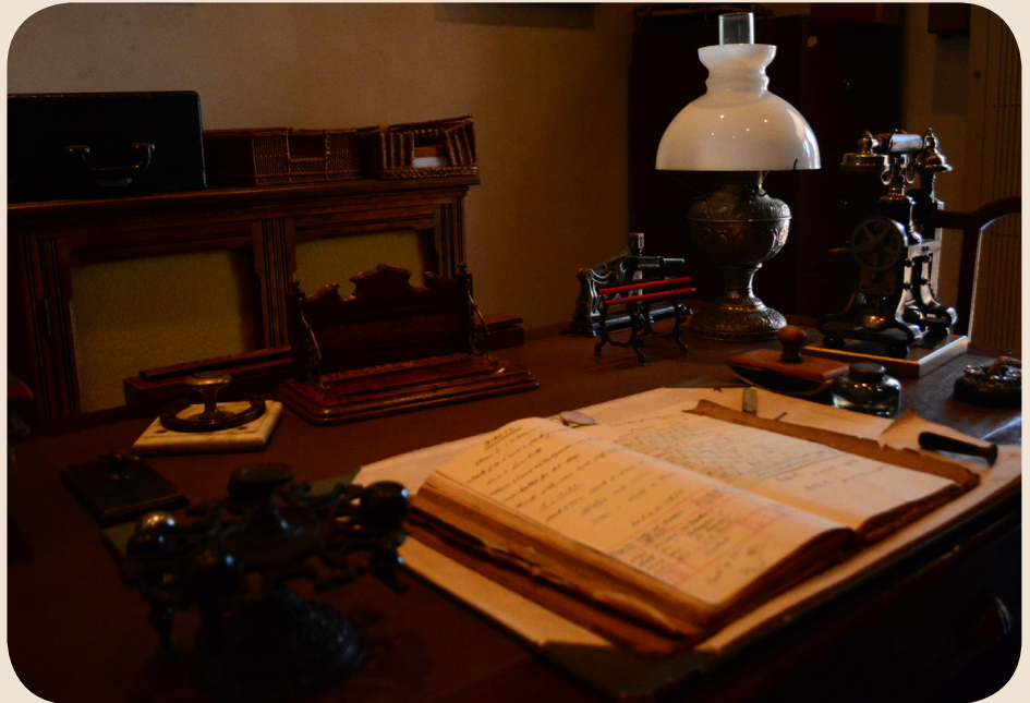
A representation of what a veterinary office may have looked like at the beginning of the twentieth century