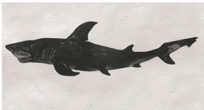
Figure 4a (top): Scavenger, 2002. Etching, aquatint, mezzotint, 100 x 200 cm. Edition of 10.