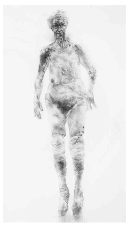
Figure 9 : Adam's Wife, Transcend series, 2010. Ash and charcoal dust drawing, 200 x 115 cm. Goodman gallery, Johannesburg. Photograph: John Hodgkiss, courtesy of Diane Victor.

suggests that the life of a human is even more fleeting and vulnerable than an already poignant material.