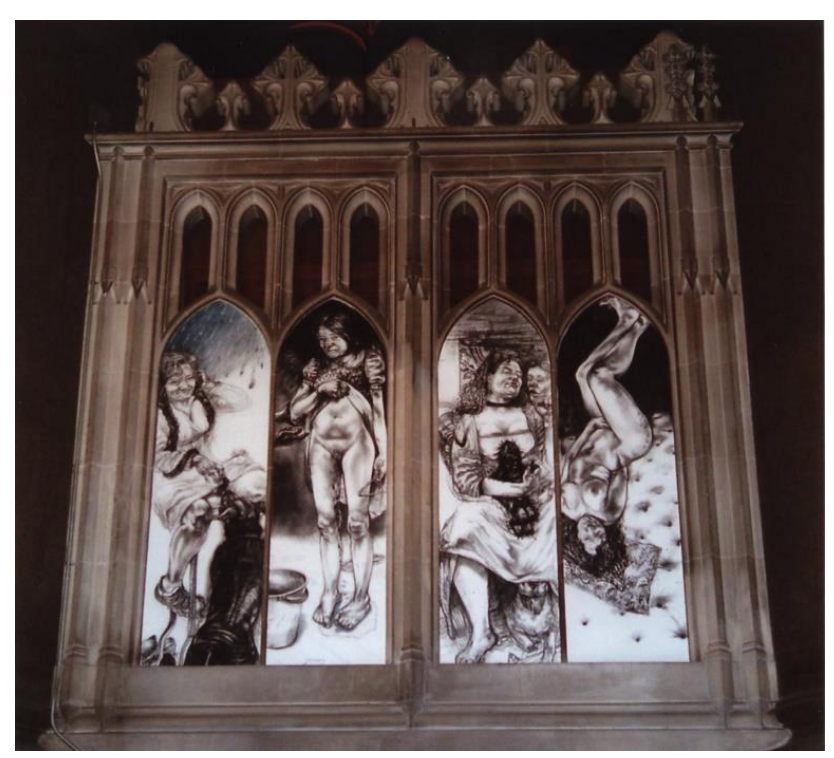
Figure 6 : Detail: The Eight Marys , 2004. Charcoal and pastel drawings, 170 x 51 cm each. Installation, Cathedral of St John the Divine, New York.