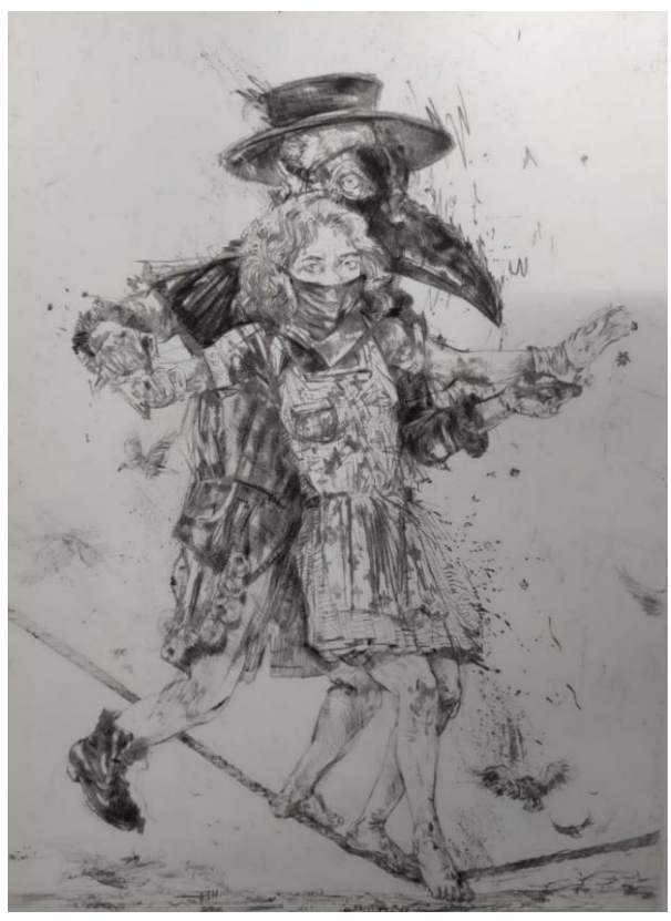
Figure 2a (left): Covid dance, a balancing act , 2020. Ash and charcoal, 195 x 140 cm. Photograph: courtesy of Diane Victor.

Figure 2b (right): Dancing with the Dr , 2020. Working proof, stained drypoint print, ca. 30 x 20 cm. Photograph: courtesy of Diane Victor and Atelier le Grand Village studio.