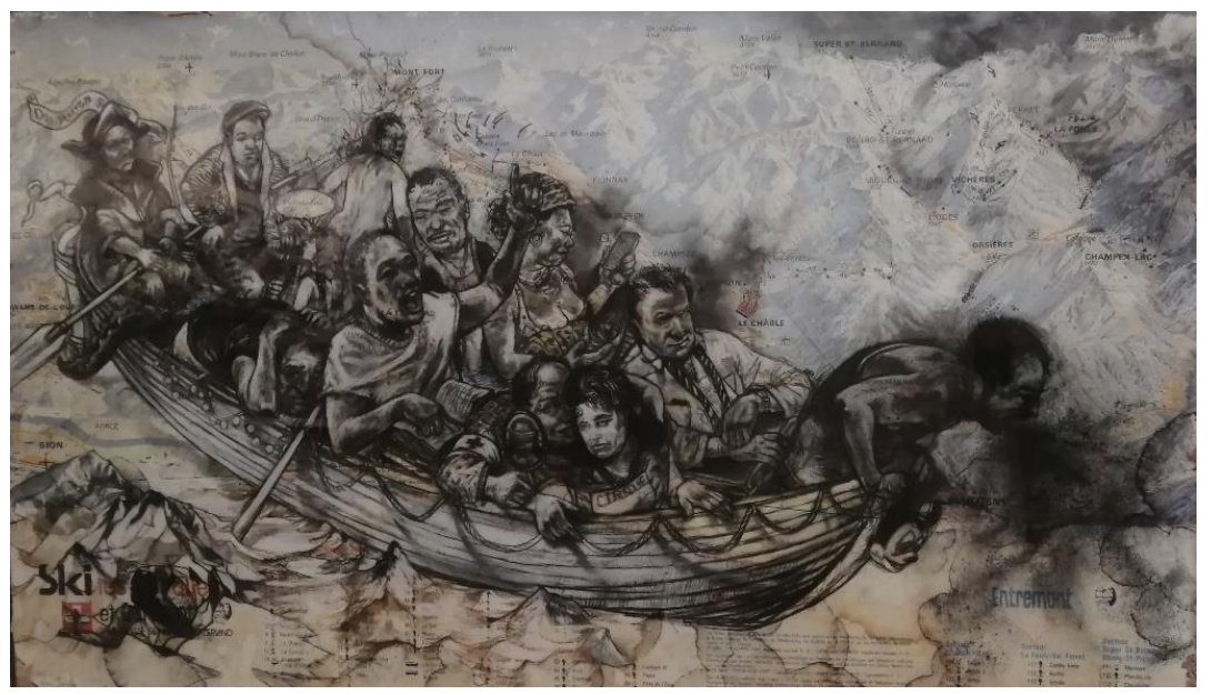
Figure 10a (top left): Sleep No More, 2012. Detail: Ash and charcoal drawing, 167 x 259 cm.

Figure 10b (top right): There's no waiting for a ship of fools, 2020. Ash drawing on paper.