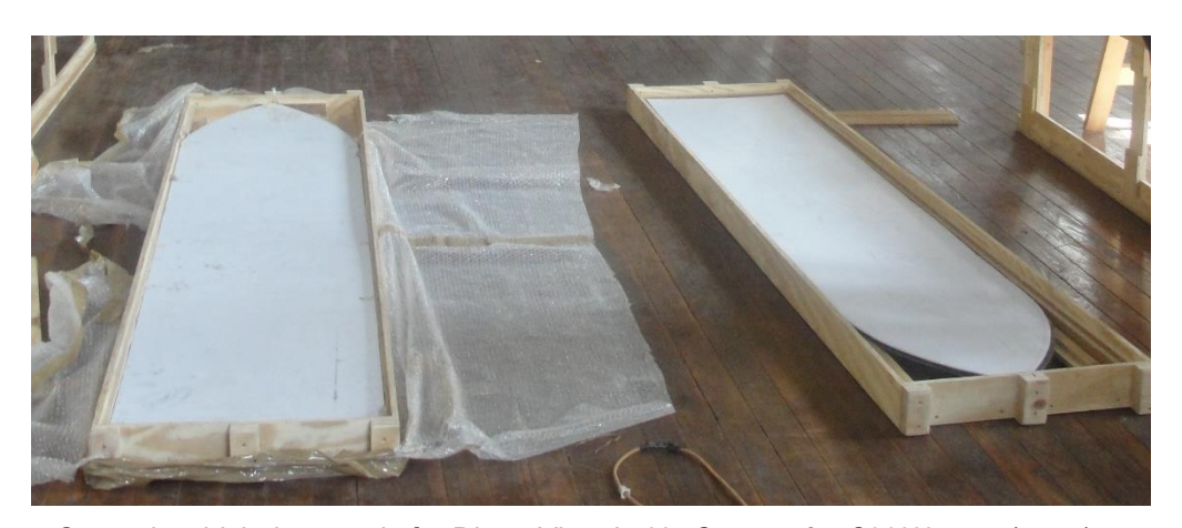
Figure 8 : Crates in which the panels for Diane Victor's No Country for Old Women (2013) are stored and transported.

destruction much like the human body. When placed as an altar piece, the figures become bodies placed on coffin-shaped glass panels much like a reliquary. The heavy wooden framework becomes a restriction or barrier, elevating the women on the one hand, while binding them to the stigma imposed on them by society on the other. The manner in which Victor stores and transports these panels, namely in wooden coffin shaped crates (Figure 8), adds to the conceptual foundation of the works (Human, 2015: 46). Each panel is carefully placed inside a wooden crate reminiscent of the shape and size of a coffin in which a body is buried. The inevitability of human death is something we all wish to ignore. On multiple levels, however, No Country for Old Women draws attention to the harsh reality of human mortality. Victor honours and consecrates the forgotten. By making reference to the tradition of gothic stained-glass windows, often commemorating martyrs of a faith, Victor captures the ghosts of women, keeping a part of them alive by elevating them to the status of saints, where they are regarded as sacred, holy and divine. Realising how fragile and vulnerable life is, the artist has found a way to capture the ephemeral in a poignant way. Victor highlights the relationship between the ephemerality of the material she uses, how these works are transported and exhibited and how fleeting and vulnerable the lives of these women were.