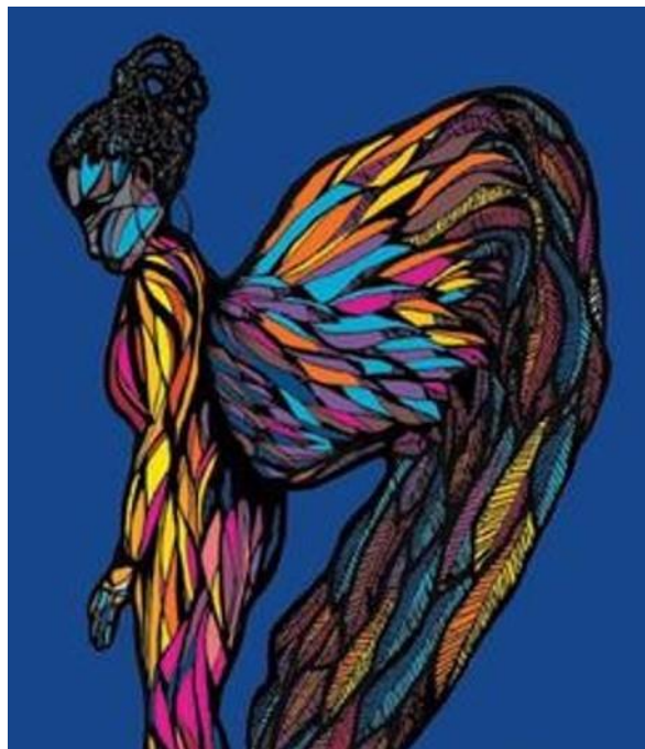
Figure 1: The cover art for Mohale Mashigo's book Intruders , created by Shubnum Khan and reproduced here with the kind permission of the artist.

Mohale Mashigo's collection of short stories Intruders , published by Picador in 2018, with an image for the cover ( Figure 1 ) 5 created by Shubnum Khan, an established writer herself. I contextualise Mashigo's book cover with reference to further examples of book covers featuring women with wings from commercial publishing houses representing local and diasporic African writers.