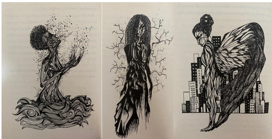
Figure 3: Shubnum Khan's art works as reproduced inside Mashigo's book to introduce each of the three sections into which the short stories are divided: "The Good", "The Bad", and "The Colourful".

The translucent radiance of stained-glass (church windows), speaks not only to the story of the high-heel killer in which the protagonist is transformed into a winged figure of power, but also relates to the theme of spirituality that runs throughout Mashigo's book. Besides the cover image, two more of artist Shubnum Khan's enchanting illustrations were included inside the book (see Figure 3 ).