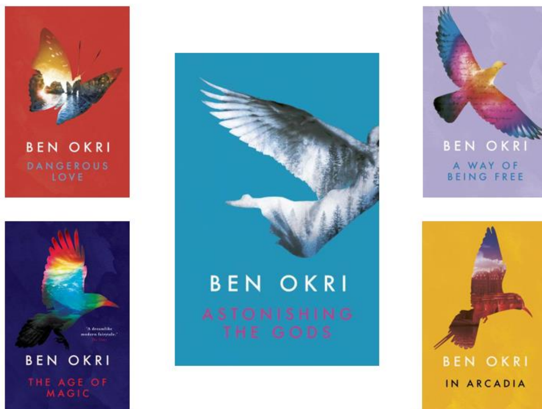
Figure 4: The cover images designed by Leo Nickolls for the 2014 editions of five of Ben Okri's books. Reproduced with the permission of HeadofZeus publishers.