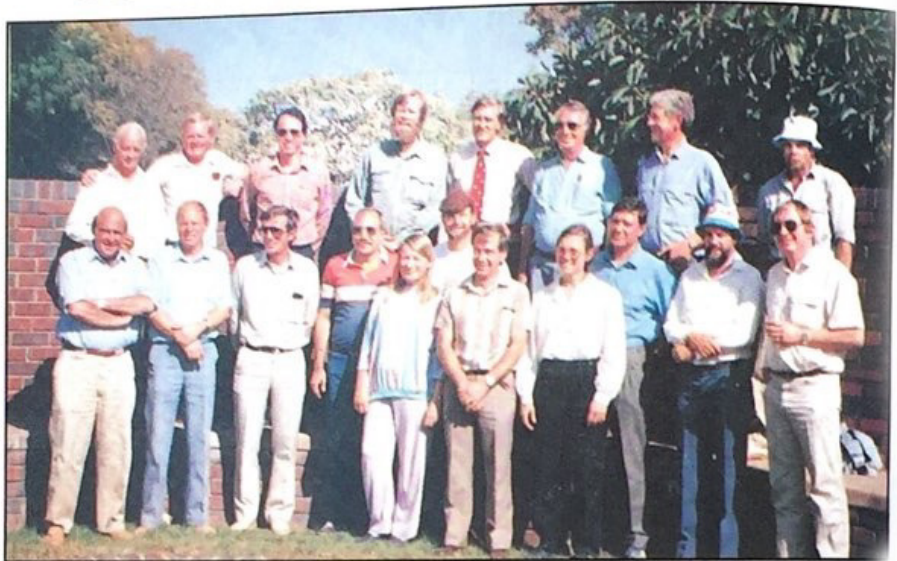
Class of '68 members at the hostel braai

Class of sixty-eighters started converging on Pretoria from all corners of the country on Friday the 28th. Festivities got under way the same evening with a cocktail party at the Burgerspark Hotel. Old contacts and friendships were taken up (in some cases after the full 21 years!) as if it were yesterday. Inside older, balder and generally more portly figures lurked the same mischievous spirits. Old stories, jokes and memories came bubbling out just as in student days. How strong and enduring those bonds have turned out to be! Accommodation was arranged at the Onderstepoort Residence for some of the participants and their wives and children. Talk about reliving old times! (The story continues on page 27, but here are the photographs)