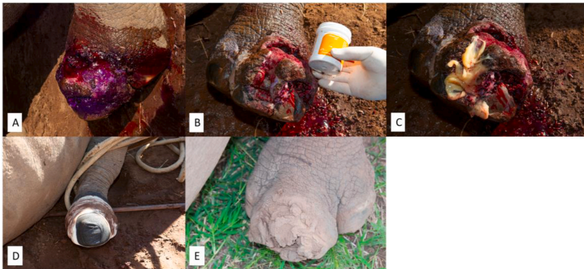
Fig. 1. Wound on the left hind foot. A). Wound upon first presentation and cleaned with water and the antiseptic gentian violet. B). The wound was treated with MGH. C). MGH on the wound. D). After MGH application, the wound was bandaged to make sure the MGH stayed in place and no dirt could come in. E). Complete healing of the wounds after three treatments with MGH in three months' time.