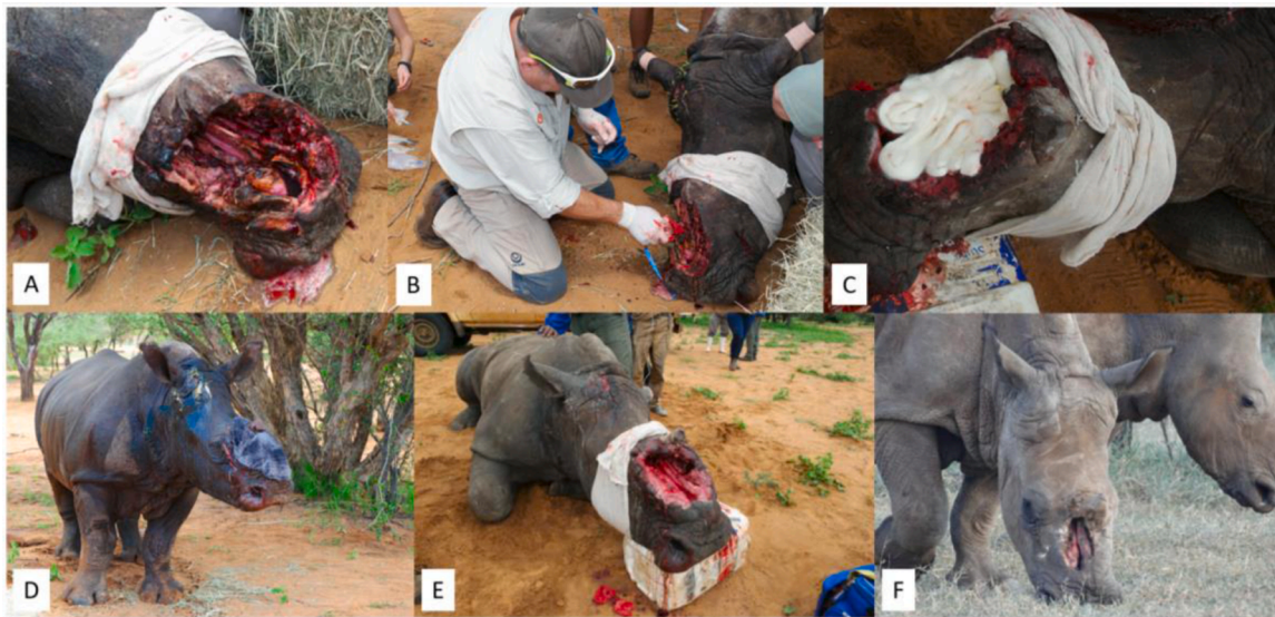
Fig. 6. Gunshot wound through the head and severe damage and loss of tissue following hacking off the horns. A). Wound upon initial presentation. B). Cleaning and treatment of the wound with MGH. C). Application of alginate dressing to cover MGH. D). Elephant skin was placed over the wound to cover it. E). Clear wound progression with abundant areas of granulation tissue following the treatment with MGH. F). Complete healing of the wound after only 6 months.