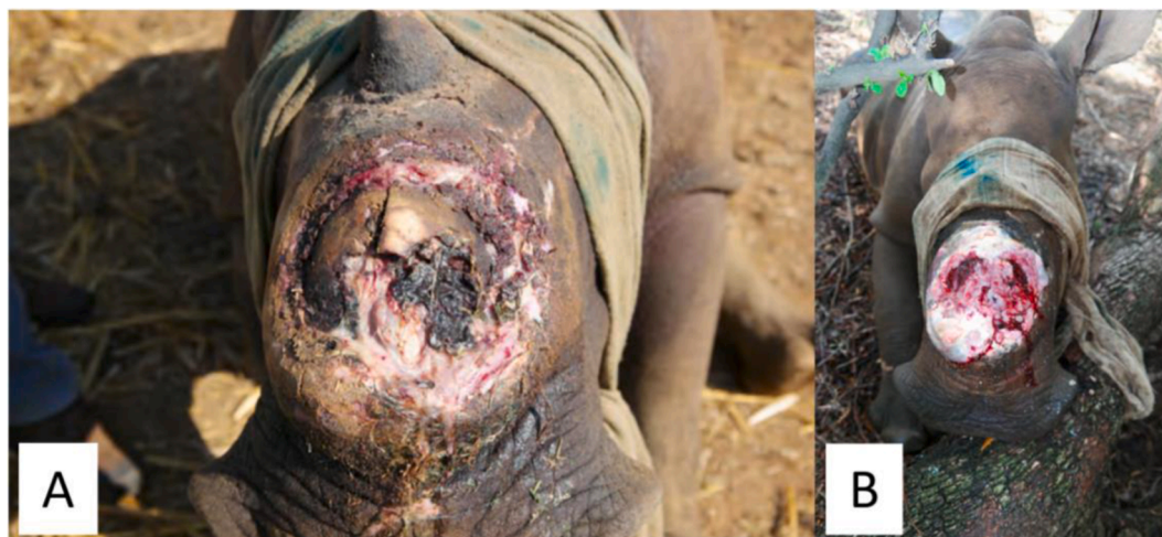
Fig. 5. A broken horn and fractures of the underlying nasal bone, accompanied with signs of infection. A). The wound with visible areas of slough and devitalized tissue at the start of MGH therapy. B). Wound progression after 6 weeks of MGH treatment, with necrotic tissue replaced by healthy granulation tissue.

through three vital operations and almost fully recovered from the wounds (Fig. 7E). Unfortunately, she died of an unrelated bacterial infection of her small intestine after having lived 18 months after her first surgery.