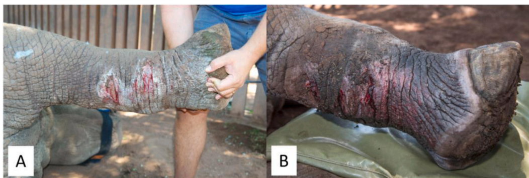
Fig. 3. Pressure sore on the right anterior leg following the wearing of a cast for the treatment of metacarpus fractures. A). Pressure sores located on the lower limb at the start of MGH treatment. B). Wound progression and decrease in inflammation after 5 days of treatment with MGH.

head with another young female. The female died but fortunately he survived, but both front horns were hacked off, resulting in severe tissue damage and loss (Fig. 6A). The wound was cleaned and treated with MGH (Fig. 6B), dressed with calcium alginate (Fig. 6C) and elephant skin was sutured on top for protection and keeping the wound covered (Fig. 6D). This procedure was repeated several times. On follow up three months later, the wound had improved significantly with absence of infection and large areas of healthy granulation tissue (Fig. 6E). The wound healed extremely well within a total of 6 months (Fig. 6F).