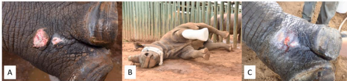
Fig. 2. An infected gunshot wound on the left anterior lower limb. A). Photo of the wound at the start of the treatment with MGH in combination with alginate. B). The leg was casted after the treatment of the wound. C). Clear progression of the wound healing, 5 days after starting the treatment.