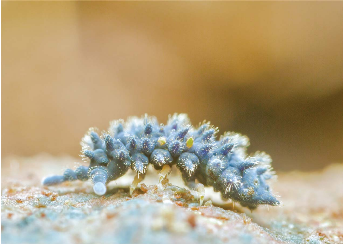
Collembola, such as this Acanthanura sp. in North Queensland, Australia, can be useful indicators of soil quality and also the focus of nature conservation measures.

Nature conservation literature and policy instruments mainly focus on the impacts of human development and the benefits of nature conservation for oceans and aboveground terrestrial organisms (e.g., birds and plants) and processes (e.g., food production), but these efforts almost completely ignore the majority of terrestrial biodiversity that is unseen and living in the soil (1). Little is known about the conservation status of most soil organisms and the effects of nature conservation policies on soil systems. Yet like “canaries in the coal mine,” when soil organisms begin to disappear, ecosystems will soon start to underperform, potentially hindering their vital functions for humankind. Soil biodiversity and its ecosystem functions thus require explicit consideration when establishing nature protection priorities and policies and when designing new conservation areas. To inform such efforts, we lay out a global soil biodiversity and ecosystem function monitoring framework to be considered in the context of the post-2020 discussions of the Convention on Biological Diversity (CBD). To support this framework, we suggest a suite of soil ecological indicators based on essential biodiversity variables (EBVs) (2) (see the figure and table S3) that directly link to current global targets such as the ones established under the CBD, the Sustainable Development Goals (SDGs), and the Paris Agreement (table S1).