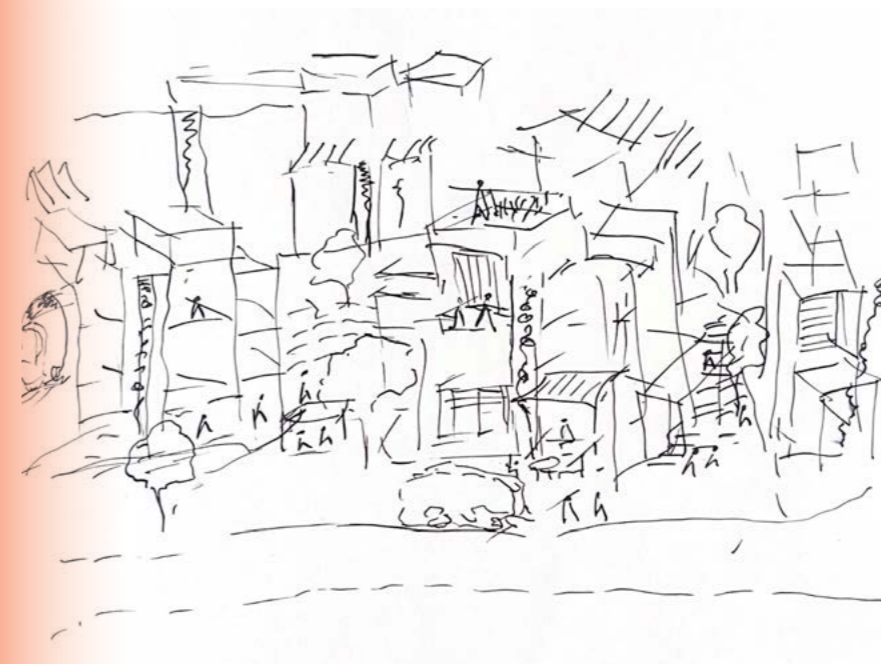
Figure 4.1.3. Reflecting on the architecture (Author 2021).

The opportunity of scarcity, became the rethinking of the gated community.