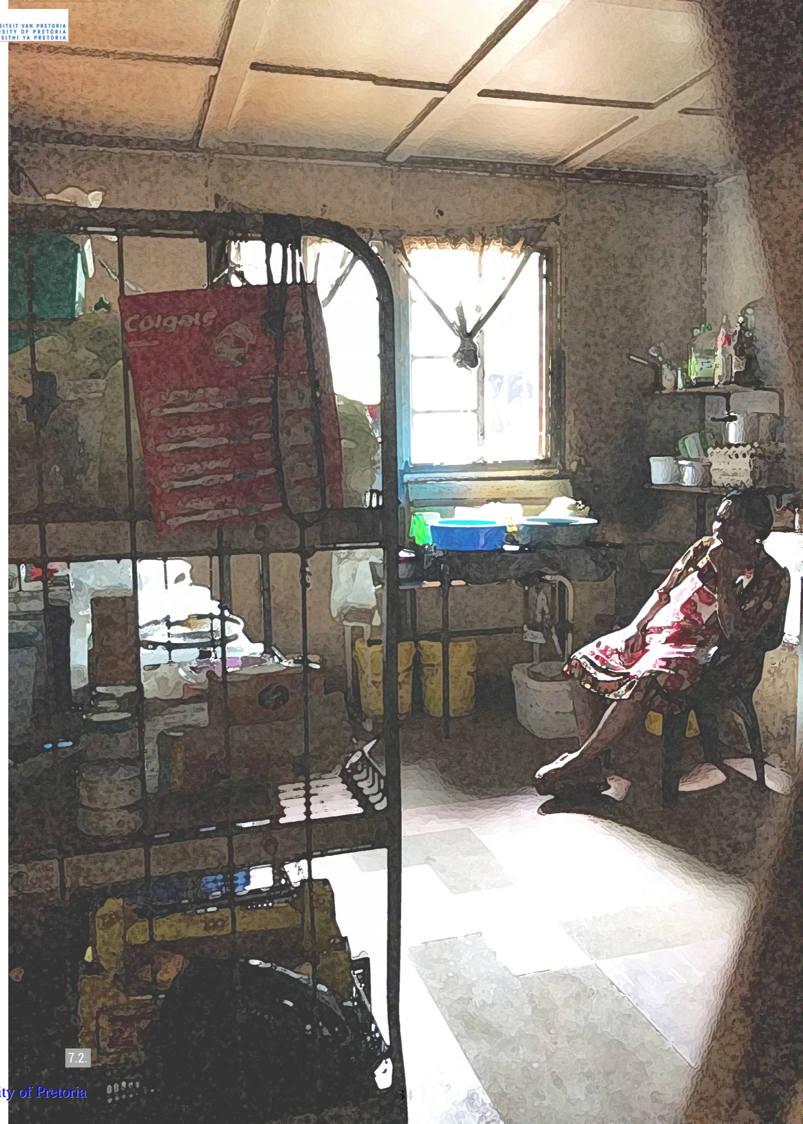
Fig. 7.1. Previous page: Photograph of 1:1000 initial site maquette (Author 2021). Fig. 7.2. Right: Photograph of an old hostel room appropriated into a tuckshop (Author 2021).

The analytical tasks in this essay, and interpretation thereof into design strategies and principles, are aimed at developing a sensitive and well-considered programmatic approach that translates into a conceptual strategy and vision for the site as a whole, which will be discussed in the final section of this essay. This site vision will serve as a conceptual framework for a more focused design intervention to follow, where the detailed design development will centre on a particular aspect and area of the overall vision.