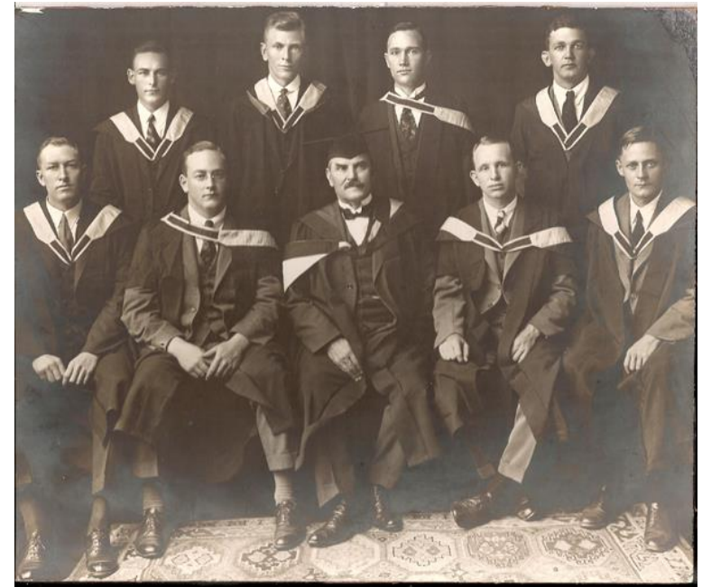
Class photo taken in 1924 of the first BVSc-graduandi in South Africa.

One of the Library's recent UPSpace projects is the uploading of the class photos of the Faculty of Veterinary Science since 1924. The Faculty launched a project to digitise all class photos and upload the photos to the UP repository where they are available to all for viewing. This project, as part of the centenary celebrations of veterinary education, also serves as a way of preserving the valuable history of veterinary science in South Africa.