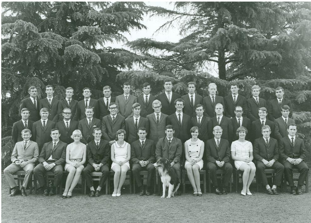
The class of 1969 featuring a dog for the first time in a class photo. Unfortunately, the dog's name is unknown.

As the collection is not complete we would like your support and assistance to obtain the following photos: