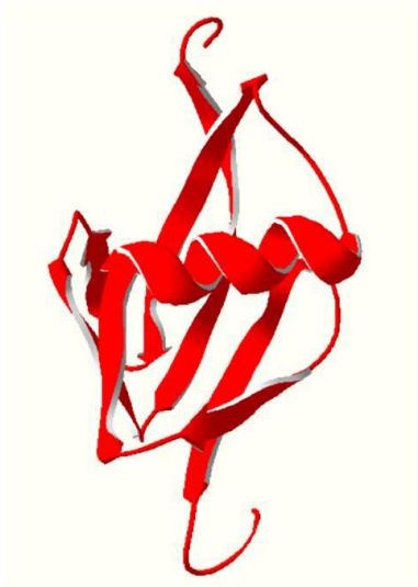
A) Wild Type RBBP6 isoform 3