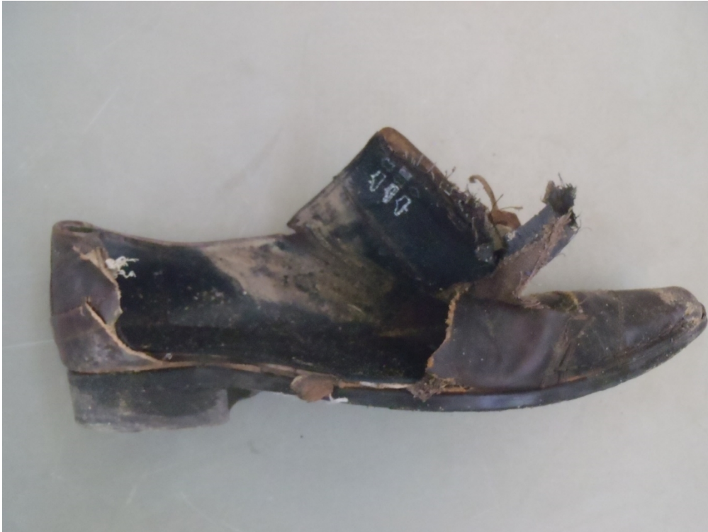
The female victim of direct lightning strike. She was found dead in the field, two days after an electrical thunderstorm. Note the tearing and tattering of the yellow t-shirt, which assisted in diagnosing the cause of death.