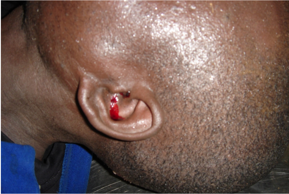
Photograph of a ruptured tympanic membrane in lightning strike.