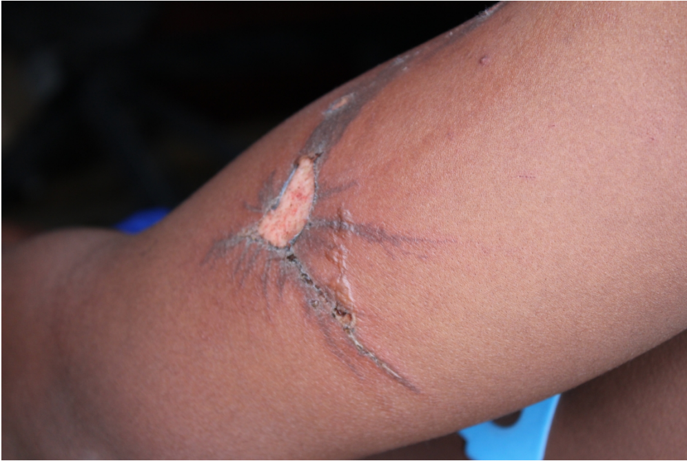
An unusual spark lesion found on the skin of a lightning strike survivor (Photograph courtesy of R Blumenthal).