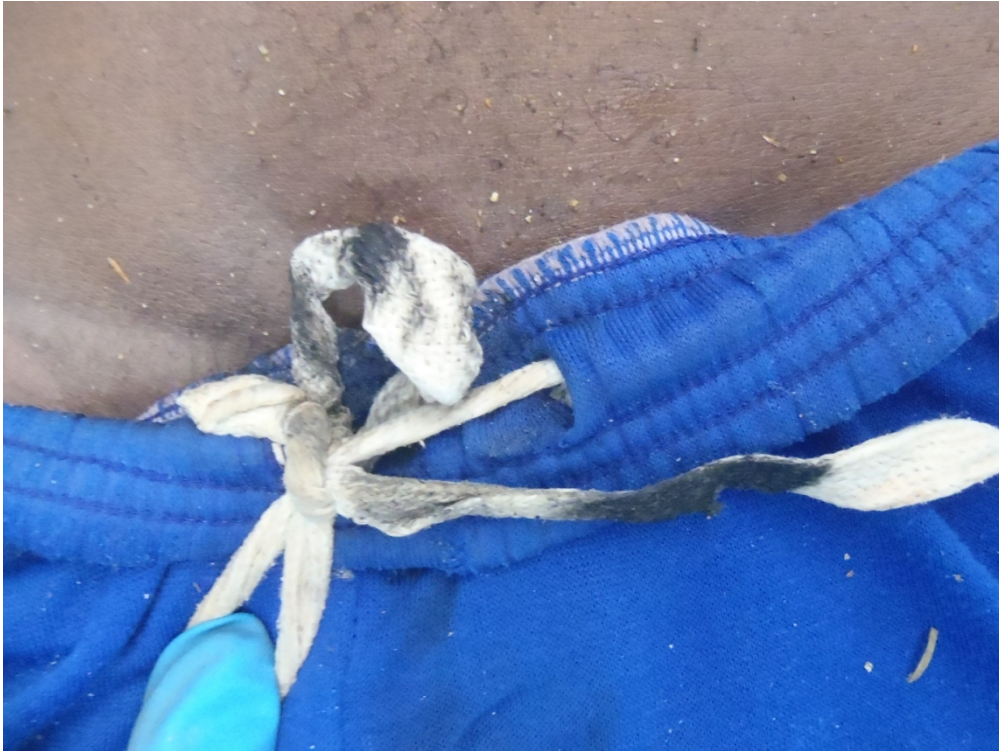
Note the scorching of the white material drawstring. This victim sustained direct lightning strike.