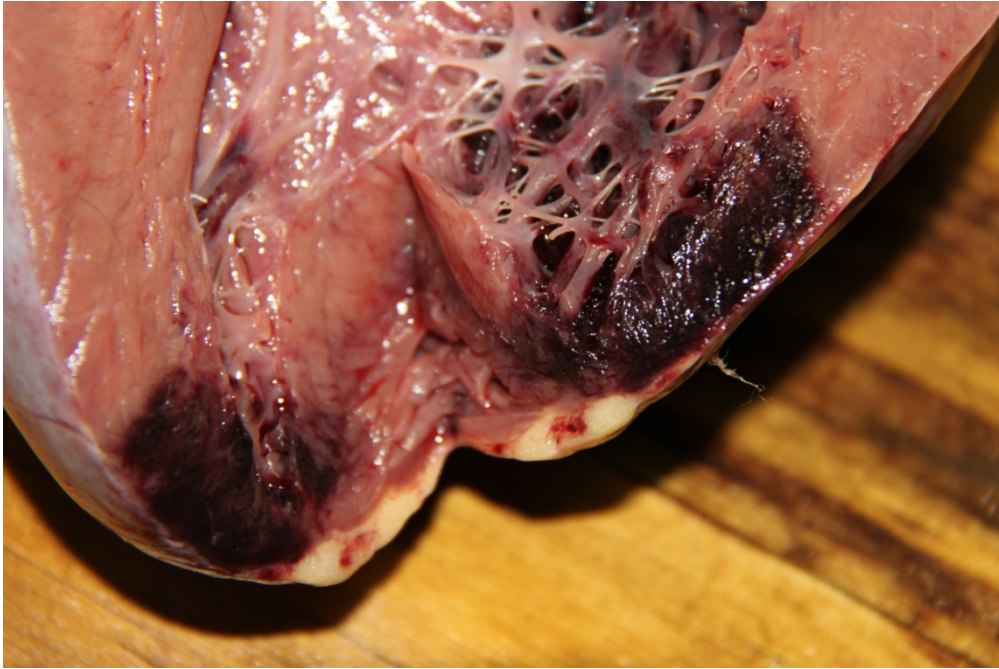
The heart muscle of a 10-year-old girl who survived lightning strike for a period of ten days in intensive care unit before dying. Note the intra-myocardial haemorrhage.