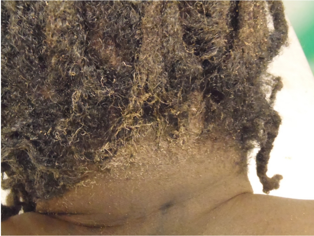
An adult female who sustained direct lightning strike. Note the singeing of the scalp hair.