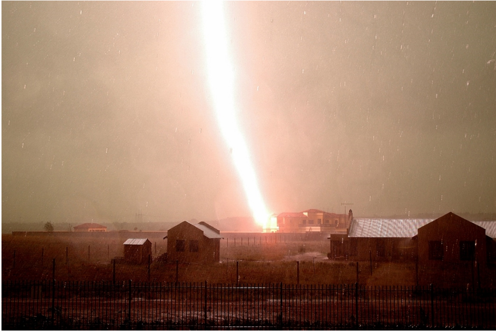
Lightning (Photo courtesy of Mrs Stuart).