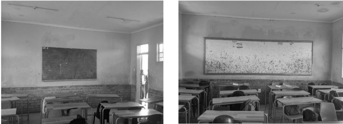
Figure 1 Photos of the chalkboard at the front of the classroom and the bulletin board at the back of the classroom. All walls are barren.