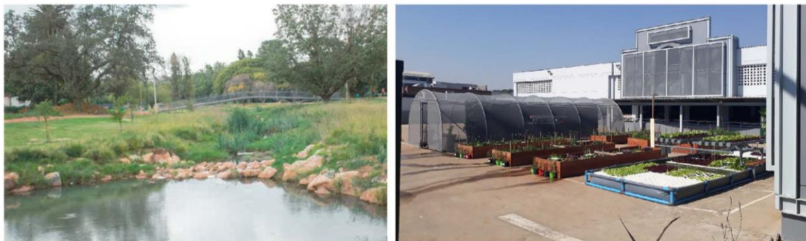
Figure 2: Images of Paterson park (left) and A Good Year farm (right).

In the built environment these alternative approaches can be CCA frameworks that guide development in specific contexts. Several more generic CCA frameworks have been developed and can be adjusted for other sectors (Mukheibir & Ziervogel 2007; O'Brien & O'Keefe 2014). These generic frameworks include undertaking initial vulnerability assessments, identifying appropriate response measures, and finally, monitoring the success of these CCA strategies. To enable effective CCA measures, deep-seated change must be undertaken by not merely retaining the status quo but promoting transformation (Pelling et al. 2015; Sharpe et al. 2016). This must involve multiple sectors in the urban and rural environments, which collectively undergo deep structural CCA changes.