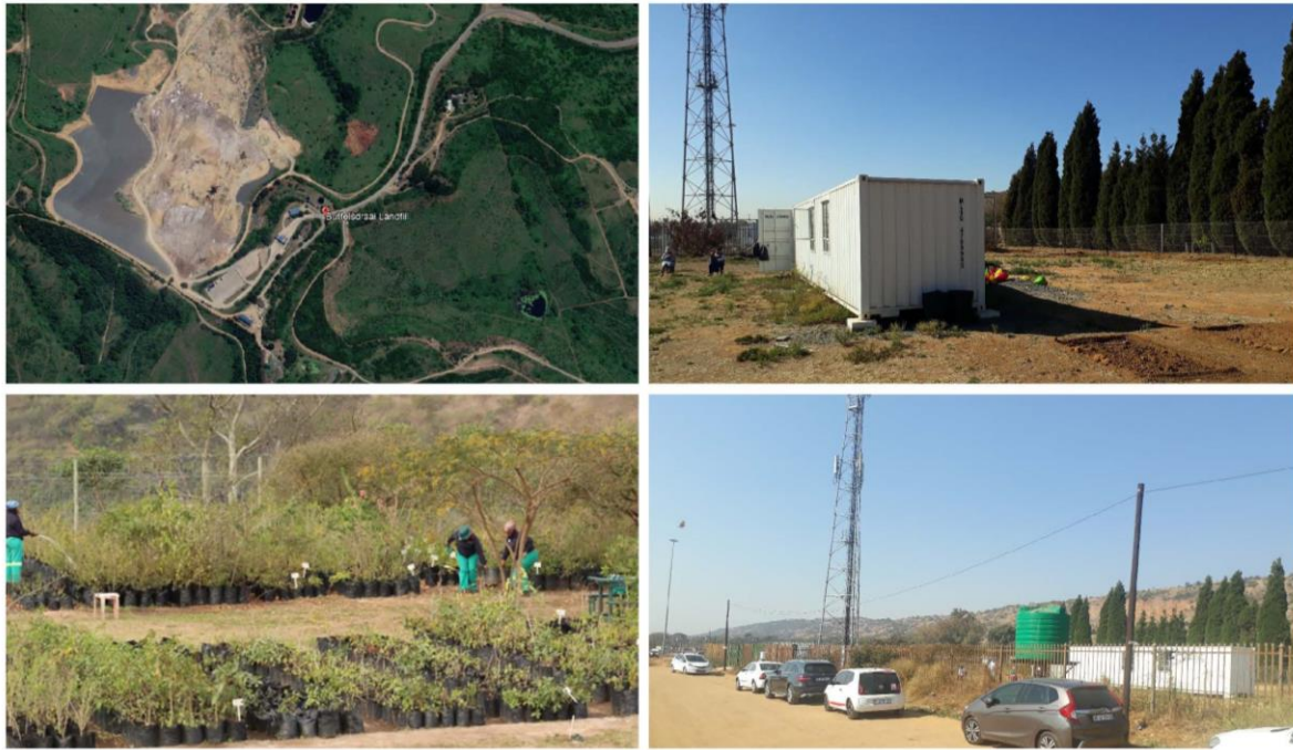
Figure 1: Images of Buffelsdraai reforestation project (left) and Melusi health post (right). (Source: Aerial photograph - Google earth, Buffelsdraai photograph: Ethikweni Municipality Website, http://www.durban.gov.za/City_Services/development_plan ).