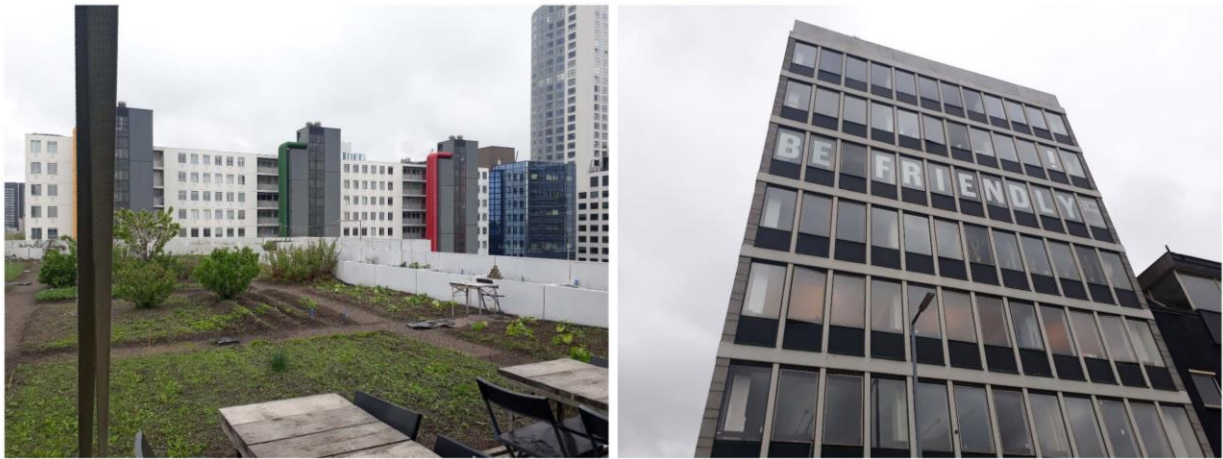
Figure 5: DakAkker, Netherlands, as a typical BIA project that improves the multifunctional quality of the existing building and context by adding additional public spaces to an existing building.

Finally, while many authors have noted that UA improves the resource consumption in cities, a closer relationship between the farms and the built environment increases its efficacy (Goldstein et al. 2016). As stated earlier, many authors have noted diverse and improved circular resource strategies facilitated through BIA (Despommier 2010; Specht et al. 2014). Additionally, Thomaier et al. (2014) argue that BIA can improve the energy efficiency of the architecture that hosts these farms. Integrating these two land-uses allows one to improve the effectiveness of their symbiotic relationship. It is important to note that the various farm types and technologies present varied opportunities to recycle resources and improve the local energy efficiencies. One such example is a highly sophisticated solution such as the ICTA-ICP building located on the Autonomous University of Barcelona campus. The integrated rooftop greenhouse on the ICTA-ICP building is a highly successful precedent that improves both the energy efficiency of the greenhouse and its associated building by retaining and reusing heat generated in the building and the greenhouse as well as using rainwater collected on the building's roof within the rooftop farm (Figure 6) (Nadal et al. 2017).