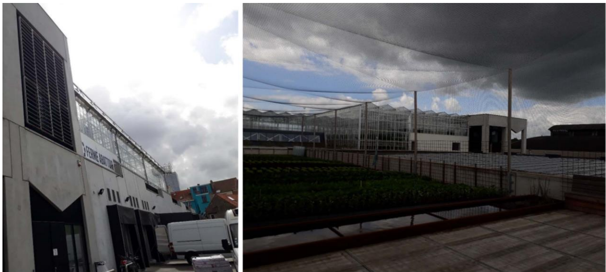
Figure 4: BIGH farm in Brussels that forms part of the urban regeneration initiative.

use efficiency, and increased resource circularity. Integrating farms with the built environment allows these productive spaces to be located close to consumers (Despommier 2010; Specht et al. 2014). This presents the opportunity to disrupt the current food network and provide local and hyperlocal produce. While the integration of consumers and producers holds a number of co-benefits, one pertinent advantage is the role that BIA plays in urban regeneration initiatives. As advocated by many, BIA projects often address socio-economic issues and improve the urban environment by upgrading local building stock (Galt et al. 2014; Jenkins 2018). The BIGH farm in Brussels is a typical example of such an approach (Figure 4)