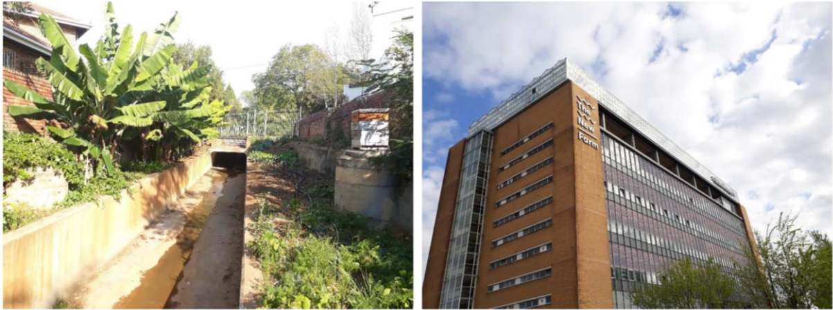
Figure 3: Existing UA farm in Tshwane and BIA farm in Den Haag, that are retrofitted to existing spaces or buildings.