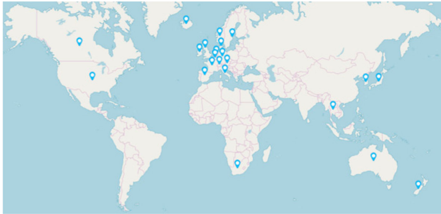
Fig. 2 Countries represented in this study that had a control program for paratuberculosis between 2012 and 2018

Europe. The majority of countries without a control program for paratuberculosis were in South and Central America, Asia and Africa (19 of 25 countries) and only 5 (20%) were in Europe (Table 6).