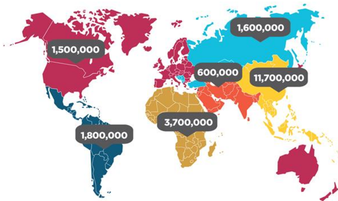
Figure 1: Global estimates on Proletariat

In understanding the push cause of migration or the north south migration, we can look into the consideration that in Sub-Saharan Africa, over 70 million children, which amounts to 22 percent of the entire youngster in the sub-Saharan African area are engaged in forced labour (see figure 1 for global victims of forced labour). 10 This goes a long way to under pin the point that most of the challenges that lead to migration are all endeared in these forced labour activities. Furthermore, the migrant workers usually travel with their family members and children included and thus endangering them. This goes a long way to the children not being able to access healthcare and education.