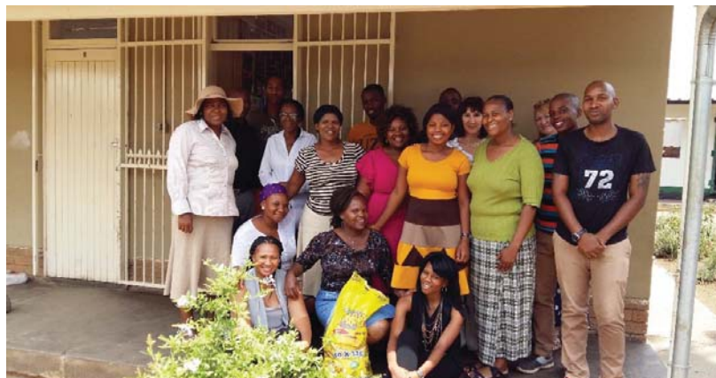
The personnel of the OP Primary School together with the Jotello Soga Library staff

On Monday 16 November 2015 a few library staff members once again paid a visit to the teachers and pupils of the OP Primary School down the road.