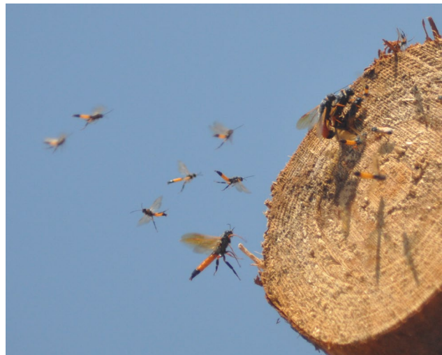
FIGURE 2 Female Sirex noctilio joining a lek of males and mating

Approximately 39% of the female S. noctilio considered in this study were subject to constrained sex allocation at the invasion front of the pest in Mpumalanga. Such constrained allocation explains in part the male bias of this population, but alone