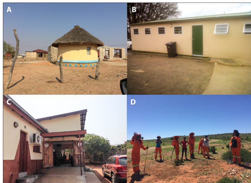
Fig. 1. Settings in which the EHRU has conducted temperature and health-related research projects: (A) dwellings in Limpopo, (B) schools in Johannesburg; (C) clinics in Limpopo; and (D) workers in Northern Cape.

Indoor thermal conditions are an important determinant of cardiovascular and respiratory health problems. [25] The EHRU has conducted temperature monitoring studies in key SA settings (Fig. 1) including homes, schools, health facilities and places of work. We found that mean indoor dwelling temperatures were often higher than outdoor temperatures and frequently exceeded international and national recommendations