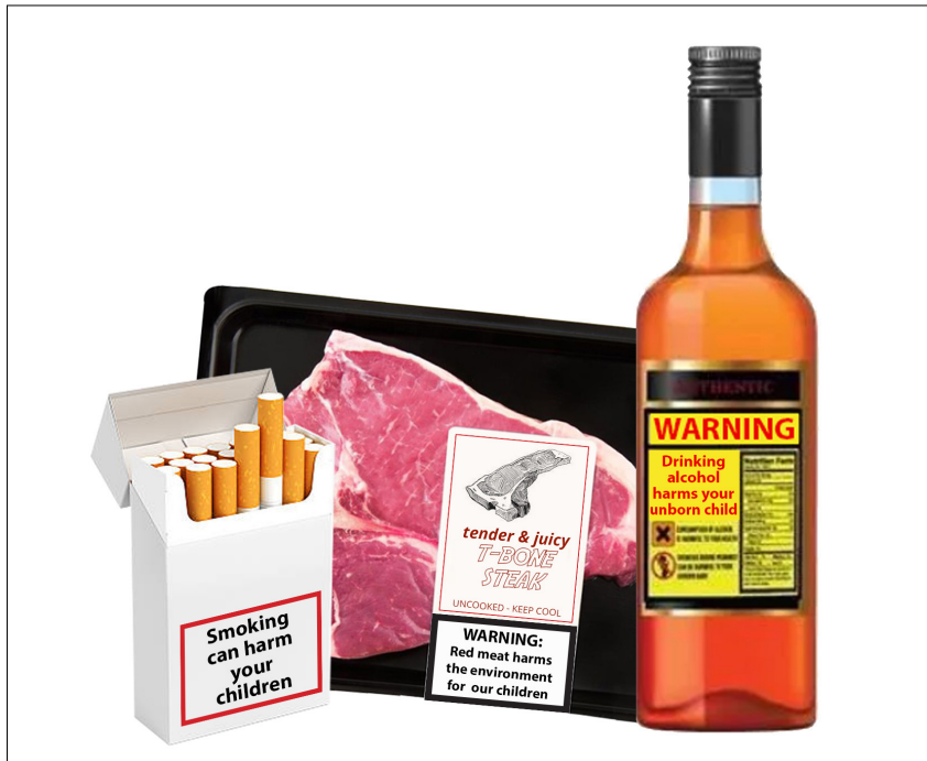
Fig. 2. Health and environment warnings on ruminant meat products could raise awareness of methane emissions and deforestation as consequences of cattle farming.