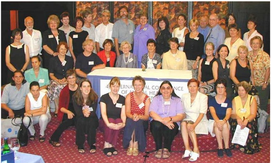
The attendants of the 4 th International Conference of Animal Health Information Specialists in Budapest