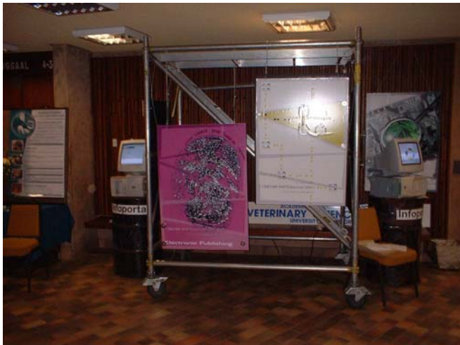
The Infoportal display at Faculty Day 2003