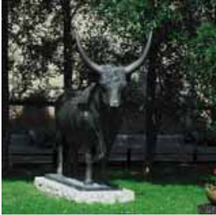
The Hungarian Grey Breed - the emblem of the Veterinary University in Budapest.