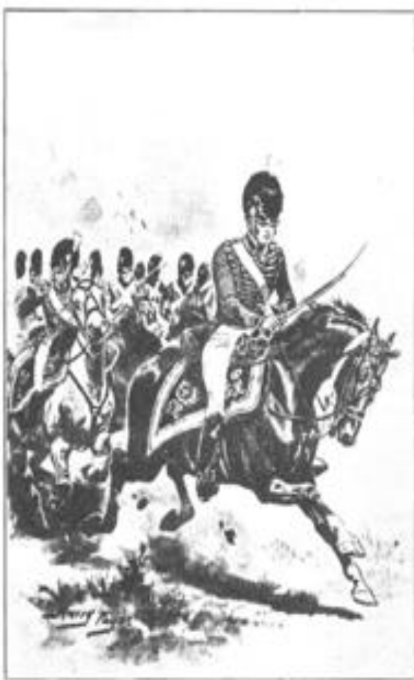
8th (King's Royal Irish) Light Dragoons 1855 (Reprod. from Cavalry Journal 1911).