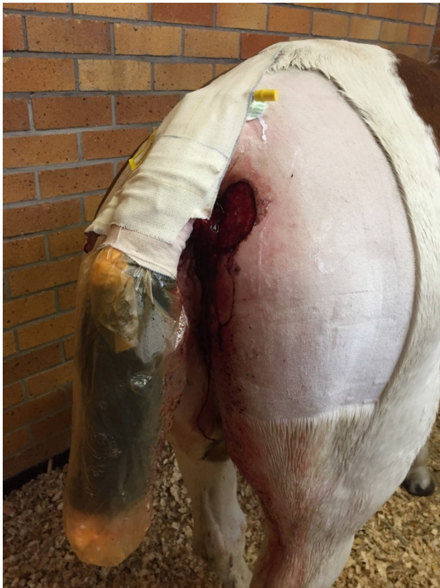
Figure 3. The surgical site in the immediate post-operative period.

The lateral, ventral and dorsal borders of the lesion were resected using sharp surgical incision with borders of 2 cm achieved. The medial border was resected using a diode laser (980 nm Diode Laser System, Diodevet 8 ) due to the proximity to the anal wall. Laser incision was performed with the laser in a continuous mode and 30 W of power. An initial skin incision was completed and traction was placed on the lesion with towel clamps. After removal of the mass, subcutaneous tissue and skin margins, the entire surgical site was ablated in two directions with the diode laser at 90 degrees to each other (Fig 3). Ablation was considered complete when the tissue was dark yellow to brown and appeared desiccated.