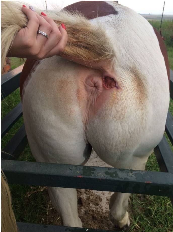
Figure 2. The mass at presentation.

General physical examination at presentation revealed normal clinical parameters and mentation with no evidence of right hindlimb regional lymphadenopathy or obvious lymph node metastasis. Palpation of the perianal region revealed a nonpainful, irregular, ulcerated cutaneous mass of 4 cm in diameter in the hairless, nonpigmented skin of the right mid-perianal region. The adjacent skin lateral to the lesion was thickened and the subcutaneous tissue exposed below the ulcer had a granular appearance. A squamous cell carcinoma was suspected and surgical excision was discussed with the owner. In view of the proximity of the medial aspect of the lesion to the right anal wall, a combination of sharp surgical excision, laser excision and chemotherapy was planned, understanding sedation and with epidural anaesthesia.