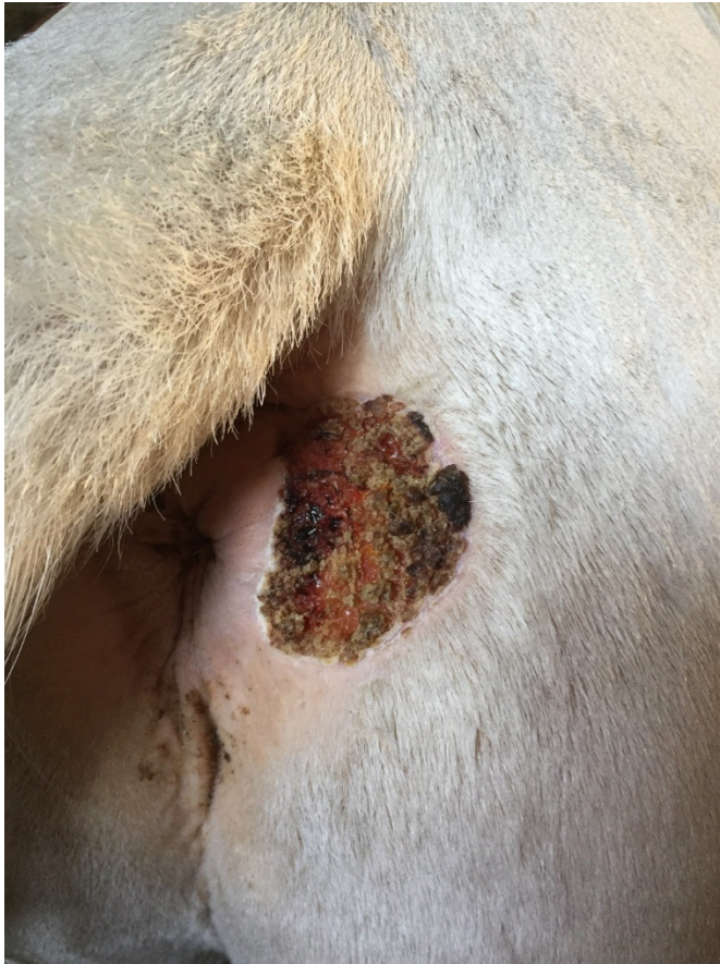
Figure 4. The surgical site at 2 weeks post-operatively.