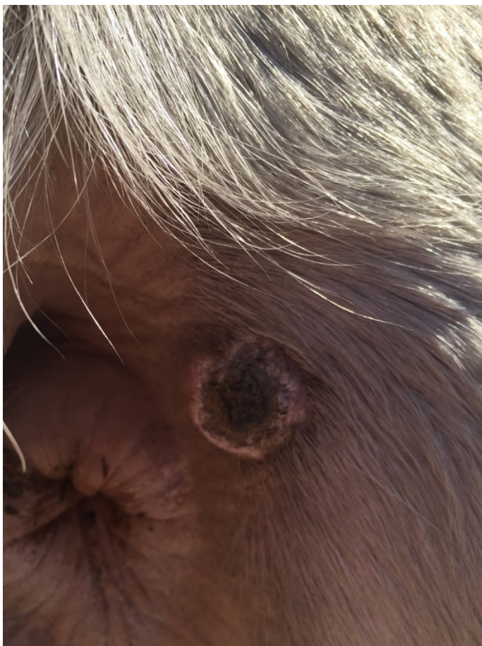
Figure 1. The mass approximately 12 months prior to presentation.

A 25-year-old American Paint gelding weighing 375 kg was presented to the Onderstepoort Veterinary Academic Teaching Hospital (OVAH), University of Pretoria, for evaluation of an ulcerated mass of non-pigmented skin of the right perianal region. The owner had reported that the mass had increased in size gradually over 12 months (Figs 1 and 2) with ulceration shown in the last 4 weeks of this period, prompting referral. The pony had shown no dyschezia, weight loss or change in demeanour during the previous 12-month period.