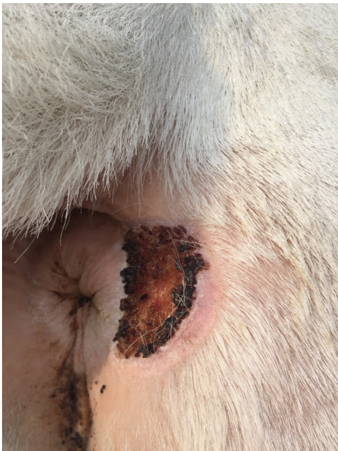
Figure 5. The surgical site at 5 weeks post-operatively.