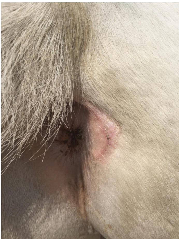
Figure 6. The surgical site at 26 weeks (6 months) post-operatively.

At re-examination 26 weeks post-surgery the pony was clinically healthy with no visible lesions of the anus and perianal region (Fig 6). The owner reported that the horse had not had difficulty defecating, had appeared normal in the post-operative period and had not shown weight loss.