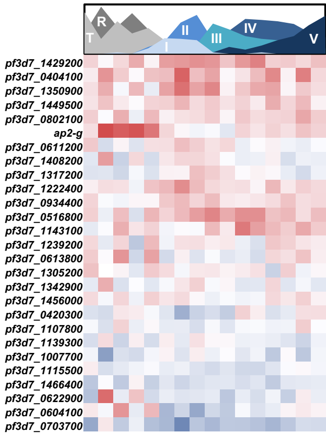
Additional Figure 2. Transcript abundance of ApiAP2 transcription factors during P. falciparum gametocyte development