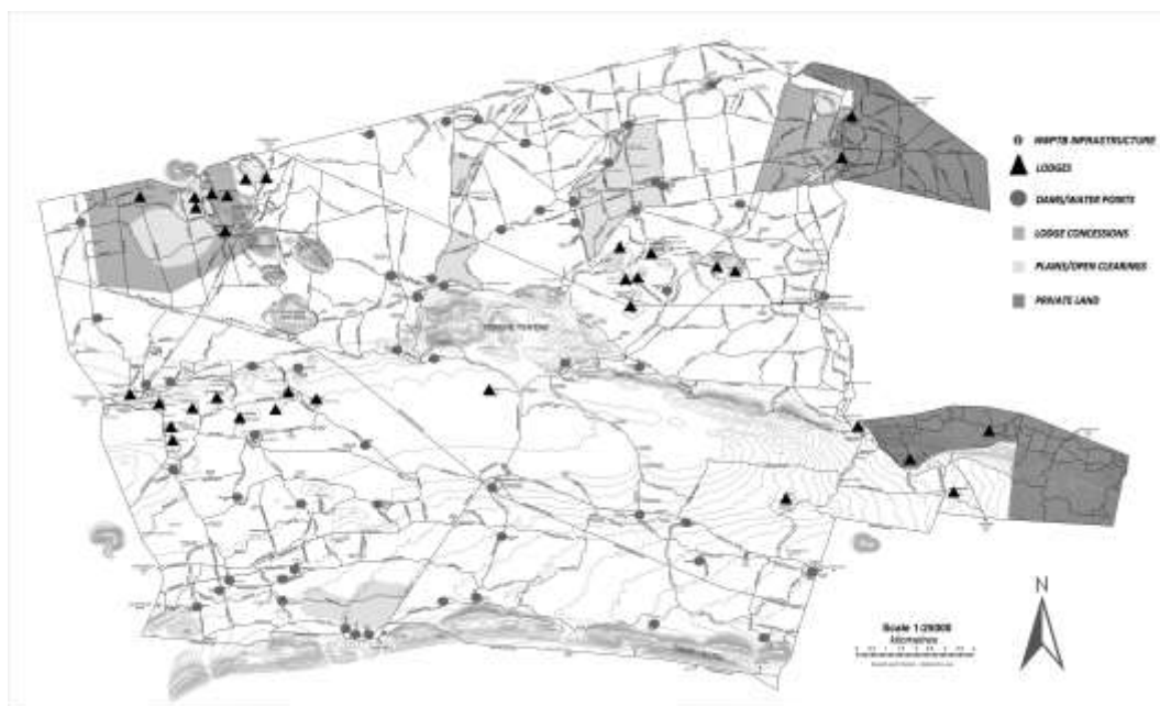
Figure 1. Map of Madikwe Game Reserve, South Africa, in 2014. Dark grey areas are private concessions, grey areas are private concessions used with lodge permission, and light grey areas are open plains where off-roading was prohibited. Lines are roads, triangles are locations of lodges, and all waterholes (containing water either year-round or during the wet season) are indicated as circles. Map courtesy of P. Hattingh (2014).

Madikwe Game Reserve (Madikwe) is a reserve managed by a state/private/communal partnership (Fig. 1). The reserve, approximately 680km 2 in size, was fenced and held an estimated 1348±128 elephants (July 2017, P. Nel, pers. comm. ) that is, 1.9 elephants per km 2 , representing one of the highest population densities of elephants in South Africa. Elephants were first introduced to Madikwe in 1992 when 25 orphaned juvenile elephants from Kruger National Park culls (operations where herds of adult individuals were lethally wounded, and youngsters translocated to other reserves as a measure of population control) were introduced. In 1994, entire herds (194 individuals) from Zimbabwe were introduced from a background of severe drought, two bush wars and heavy poaching. In 1998 and 1999, six and two adult bulls (measured by a minimum 3.2 m shoulder height) were introduced from Kruger National Park, respectively.