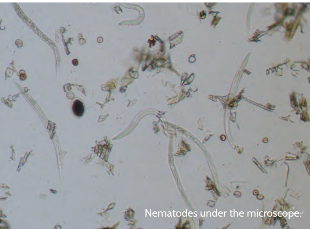
Nematodes under the microscope.