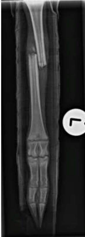
Figure 4. A dorsoplantar radiograph of the left metatarsus at time of presentation in case 2. Soft tissue swelling and osteomyelitis of the proximal metatarsus are evident.

The radiographic examination (figure 4) revealed a comminuted mid-metatarsus fracture with significant craniomedial displacement of the distal limb. There was evidence of osteomyelitis of the mid to proximal metatarsus with areas of bone resorption and regions of radiolucency in the medulla of the metatarsus. Significant soft tissue swelling was evident at the fracture site.