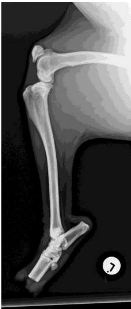
Figure 2. A lateromedial radiograph of the left tarsus and previous amputation site at the left metatarsus of case 1. Lysis of the medullary cavity of the metatarsus is evident consistent with osteomyelitis.

The radiographic evaluation ( figures 2 and 3 ) revealed structural changes of the remaining left metatarsus consistent with osteomyelitis. These included areas of bone resorption with regions of radiolucency in the medulla of the proximal mid-metatarsus. A radiographic evaluation of the right metatarsus was also performed to allow for comparative measurements to be obtained and production of a prosthesis if required in the future.