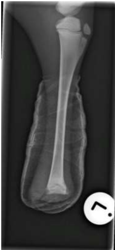
Figure 6. A lateromedial radiograph of the left tibia after amputation at the level of the tibiotarsal joint in case 2.

The surgical approach and technique was the same as in case 1 (figure 6). Postoperative care included 2.5 mg/kg bwt/hour intravenous fluid therapy (Ringers Lactate; Fresenius Kabi) for a 24-hour period, 0.1 mg/kg bwt intravenous butorphanol tartrate (Butorphanol; Kyron Laboratories, Johannesburg, South Africa) once daily for a 24-hour period, 10 mg/kg bwt subcutaneous amoxicillin clavulanic acid (Synulox; Pfizer) once daily for a 72-hour period and 0.6 mg/kg bwt subcutaneous meloxicam (Metacam, Ingelheim Pharmaceuticals) once daily for a 72-hour period.