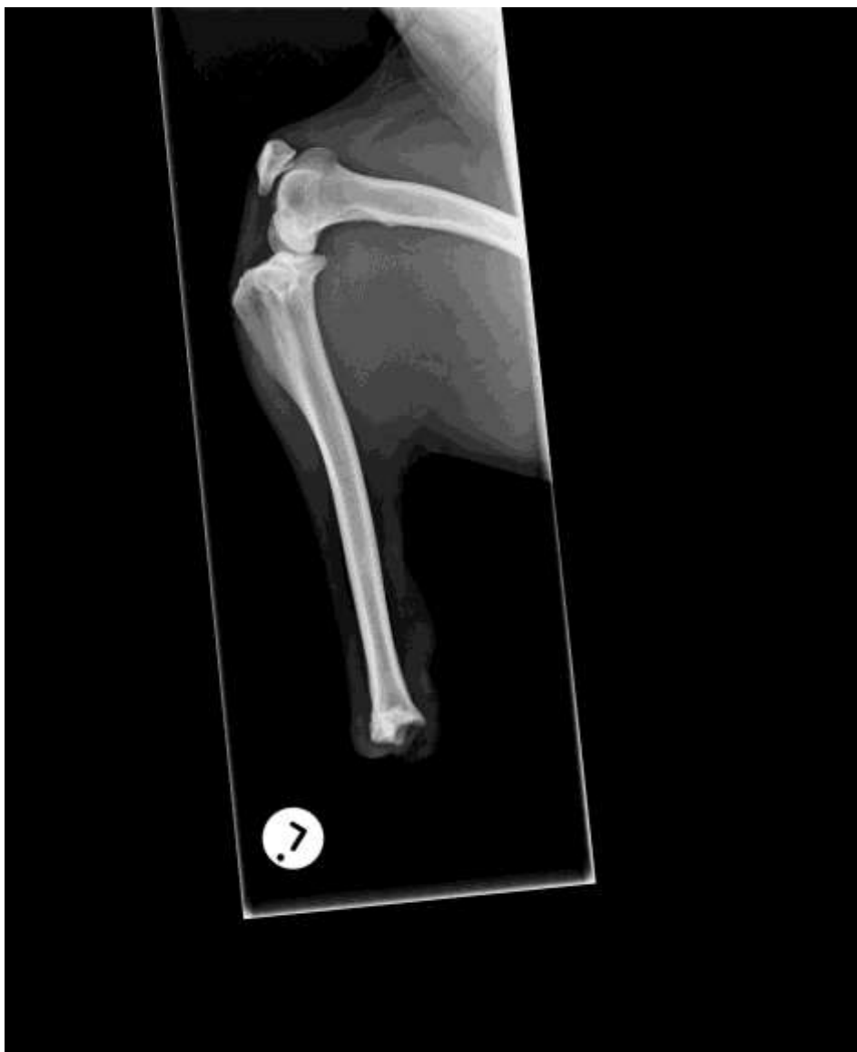
Figure 5. A lateromedial radiograph of the left tibia after amputation at the level of the tibiotarsal joint in case 1.