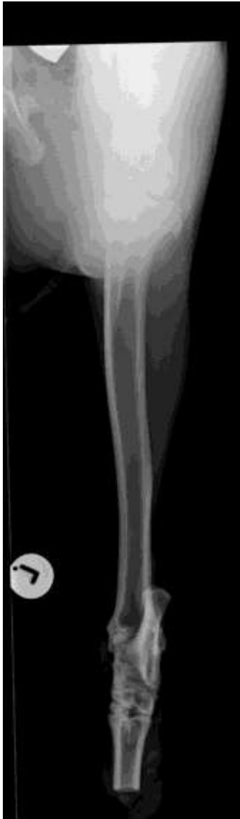
Figure 3. A dorsoplantar radiograph of the left tarsus and previous amputation site at the left metatarsus of case 1. Lysis of the medullary cavity and sclerosis of the remaining metatarsus are evident, consistent with osteomyelitis.

A provisional diagnosis of osteomyelitis of the proximal mid-left metatarsus was made and surgical excision via amputation at the level of the tibiotarsal joint under a general anaesthesia protocol was subsequently decided upon. This amputation site was selected to allow for the placement of a prosthesis which was planned as a second surgical procedure.