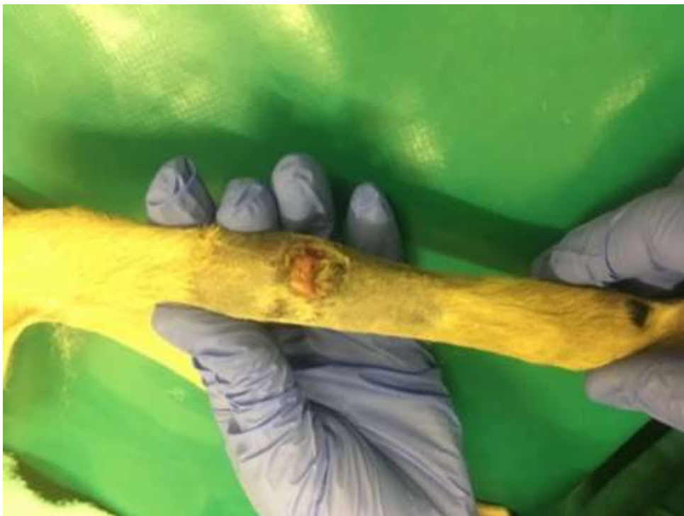
Figure 1. The left metatarsus of the springbok in case 2 at presentation. The open comminuted fracture of the mid-metatarsus is evident. Extensive soft tissue swelling and necrotic subcutaneous tissue are visible.

Clinical examination at presentation revealed the springbok to have normal clinical parameters and mentation. Palpation of the left metatarsus revealed a complete open mid-metatarsus fracture to be present. A significant malodour was associated with the fracture site and both purulent discharge and necrosis of the skin and subcutaneous tissues were evident (figure 1). No other abnormalities were evident on a general physical examination. An osteomyelitis of the left metatarsus and infection of the skin and subcutaneous tissues was suspected and a decision to perform a radiographic evaluation of the left metatarsus region under general anaesthesia was made.