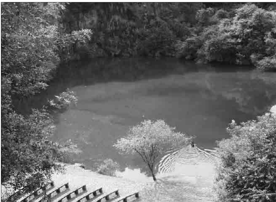
Figure 5: View onto the lake at the Bosque Zaninelli, Curitiba, Brazil

This former stone quarry was declared a forest reserve in 1992 and also houses the Unilivre (the Free University of the Environment). Apart from the Unilivre buildings (built from sustainable materials, mainly timber), the natural environment has been encouraged to re-establish in the reserve, now offering pathways, an ephemeral waterfall and a stream that drains the water collecting in the pond at the bottom of the original quarry excavations (see Figures 5 and 6).