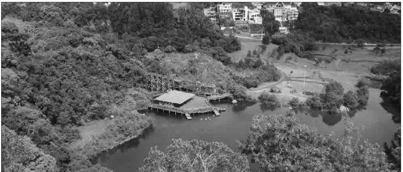
Figure 9: View onto the lake at the Parque Tanguá from the lookout, Curitiba, Brazil