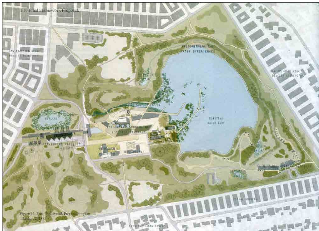
Figure 4: Proposals for the redevelopment of the Rosema and Klaver quarry in Monument Park, City of Tshwane Source: Labuschagne, 2013: 72