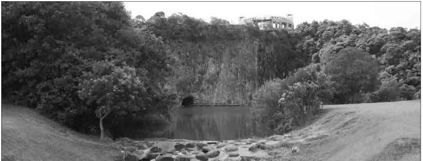
Figure 8: View onto the lake at the Parque Tanguá, with the lookout to the top right, Curitiba, Brazil