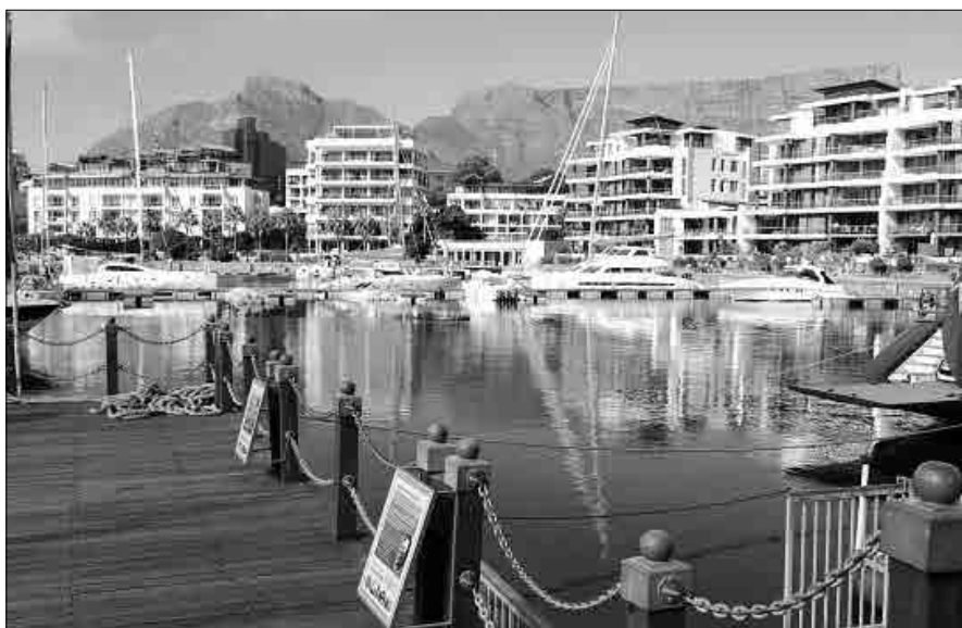
Figure 1: Cape Town residential waterfront development in a former quarry and later a fuel farm