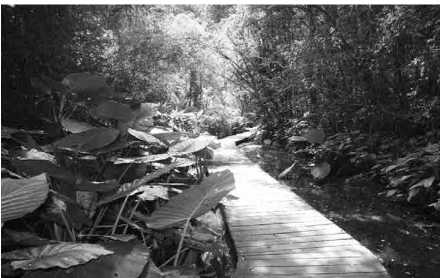
Figure 6: Boardwalk at the approach to the Bosque Zaninelli, Curitiba, Brazil