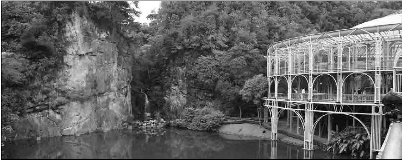
Figure 7: View onto the lake at the Parque das Pedreiras, with the Ópera de Arame (The Wire Opera House) to the right, Curitiba, Brazil