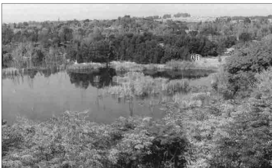
Figure 2: View over the post-industrial Rosema and Klaver quarry in Monument Park, City of Tshwane