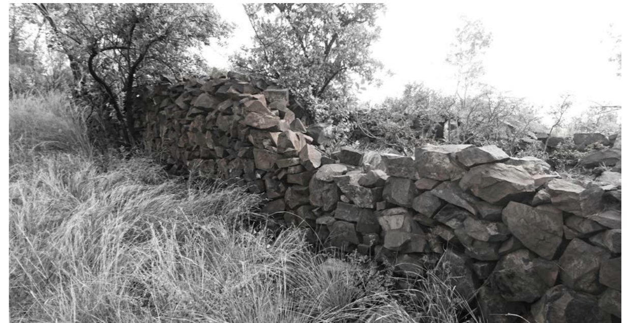
Figure 1.3 The remnants of Fort Commeline's prominent trench walls

Daarbenewens word 'n Historiese Prestasie-sentrum voorgestel wat kontekstuele gebeurtenisargitektuur as 'lewende museum' aanmoedig en as netwerk van erfenisnodusse dien en deur die uitwerking van die geskiedenis, tot die viering van die normatiewe lei. Dienend as 'n bemiddelaar tussen die mens en die bouvalle van die geskiedenis, herstel en herleef die verhouding tussen die vertelde argitektuur, wat 'n inklusiewe konstruksie van die lae van herdenking sal vorm, 'n produk wat deur tyd begrens word.