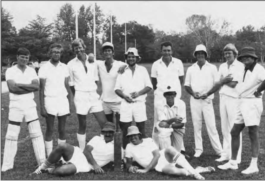
The staff cricket team (Geriatrics II) after a game against the students in 1979.

of frantic activity, when he was appointed Deputy Dean for Undergraduate Academic Affairs and oversaw the building of the Onderstepoort Veterinary Academic Hospital.