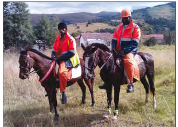
Rangers and their mounts (the 'Transkei 4x4').

One outcome of the course was that the rangers were keen to obtain good tack (as theirs is often old and broken) and it was suggested that the NSPCA could facilitate contact between their association and providers selling suitable saddles and numnahs. The ranger initiative by the Eastern Cape Department of Transport has resulted in salaries for riders and allowances