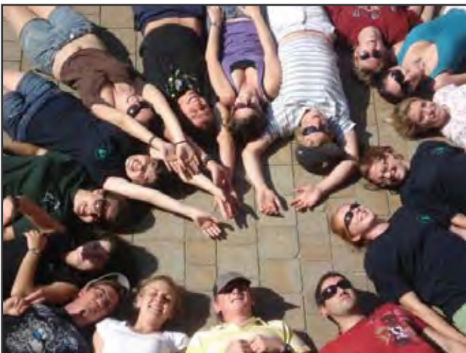
This was a once-in-a-lifetime opportunity for the students.

On the first day, we went on a guided tour of the Veterinary Medicine Faculty and the University of Warsaw. It was impressive, but secretly we all realised just how lucky and proud we should be to study at Onderstepoort. Our faculty may not have as many expensive machines and gadgets, but we have excellent lecturers, a hospital renowned for its professionalism and, to top it off, we are completely encompassed by nature and hordes of animals!