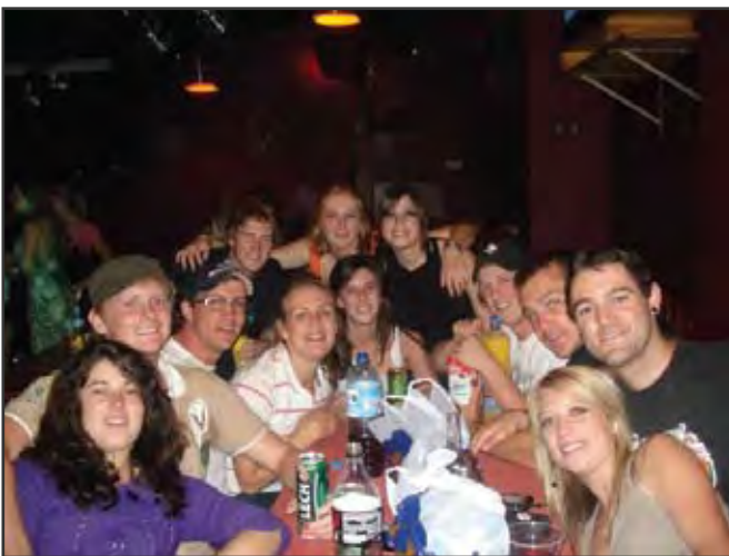
Students enjoy a night out.

On our first night at the 58 th International Veterinary Students' Association (IVSA) World Summer Congress in Poland, 18 South African veterinary students were greeted by a sea of friendly, but unfamiliar, faces around the welcoming barbeque being held at the Warsaw University residence. Within no time two facts became apparent. Firstly, the excellent itinerary awaiting us, together with our new and amazingly diverse group of international friends, was going to make the following 10 days a mind-blowing and unforgettable experience. Secondly, even the infamous African mosquitoes have nothing on the ferocious Polish variety that feasted on the unsuspecting students sitting around the fire.