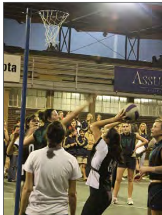
The first netball team in action.