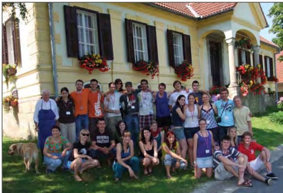
Participants in the group exchange programme of IVSA.

After a year of planning and back-and-forth emailing, 15 South Africans were on their way to Slovenia and Austria for the second group exchange programme that the International Veterinary Students' Association (IVSA) South Africa has been involved in.