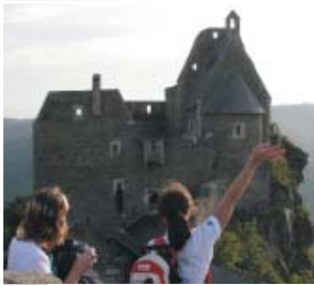
SA students overlook Fortress Aggstein in Austria.