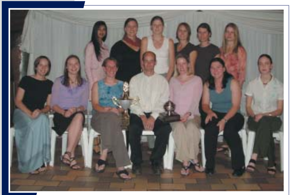
The victorious women's soccer team.