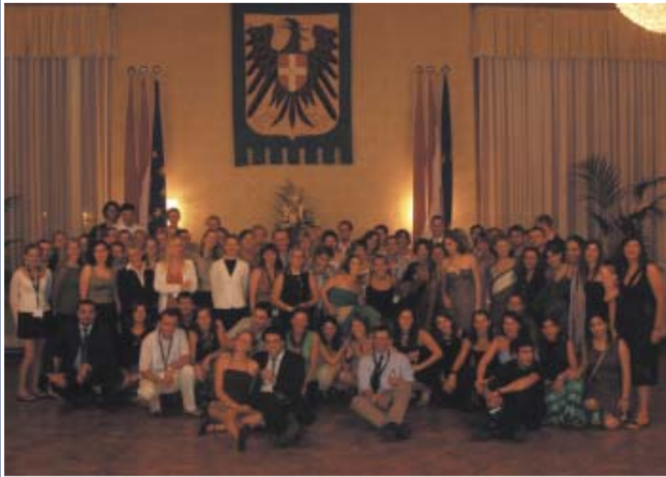
The 2005 IVSA student group in the Vienna City Hall.

The International Veterinary Students' Association (IVSA) was established in 1952, as a global, student-based association that exists to benefit the people and animals of the world.