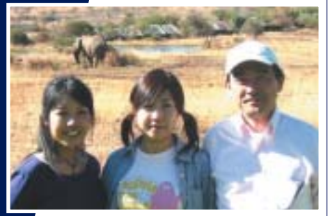
The visitors availed themselves of the opportunity to experience African wildlife in the Pilanesberg Game Reserve.

cooperation between scientific institutions in Japan and South Africa in all fields of research. This has created new funding opportunities for joint research projects that will be exploited in the near future.