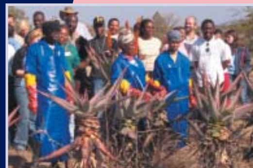
The students are pictured here with the Aloe harvesters.