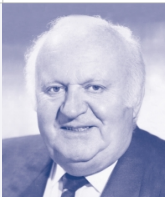
IAMS SA supports veterinary education