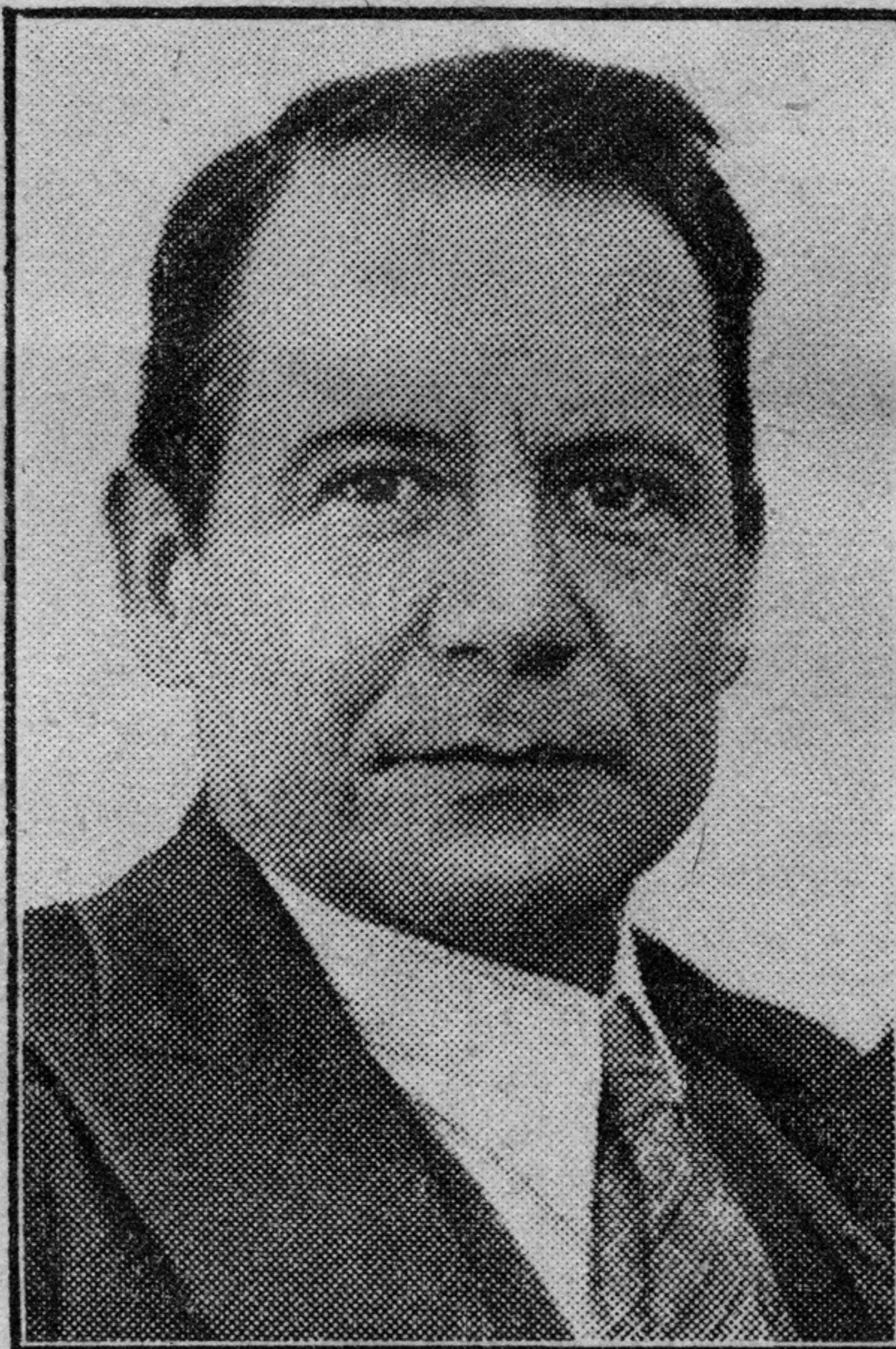
Mr Gerard Moerdyk (Architect)