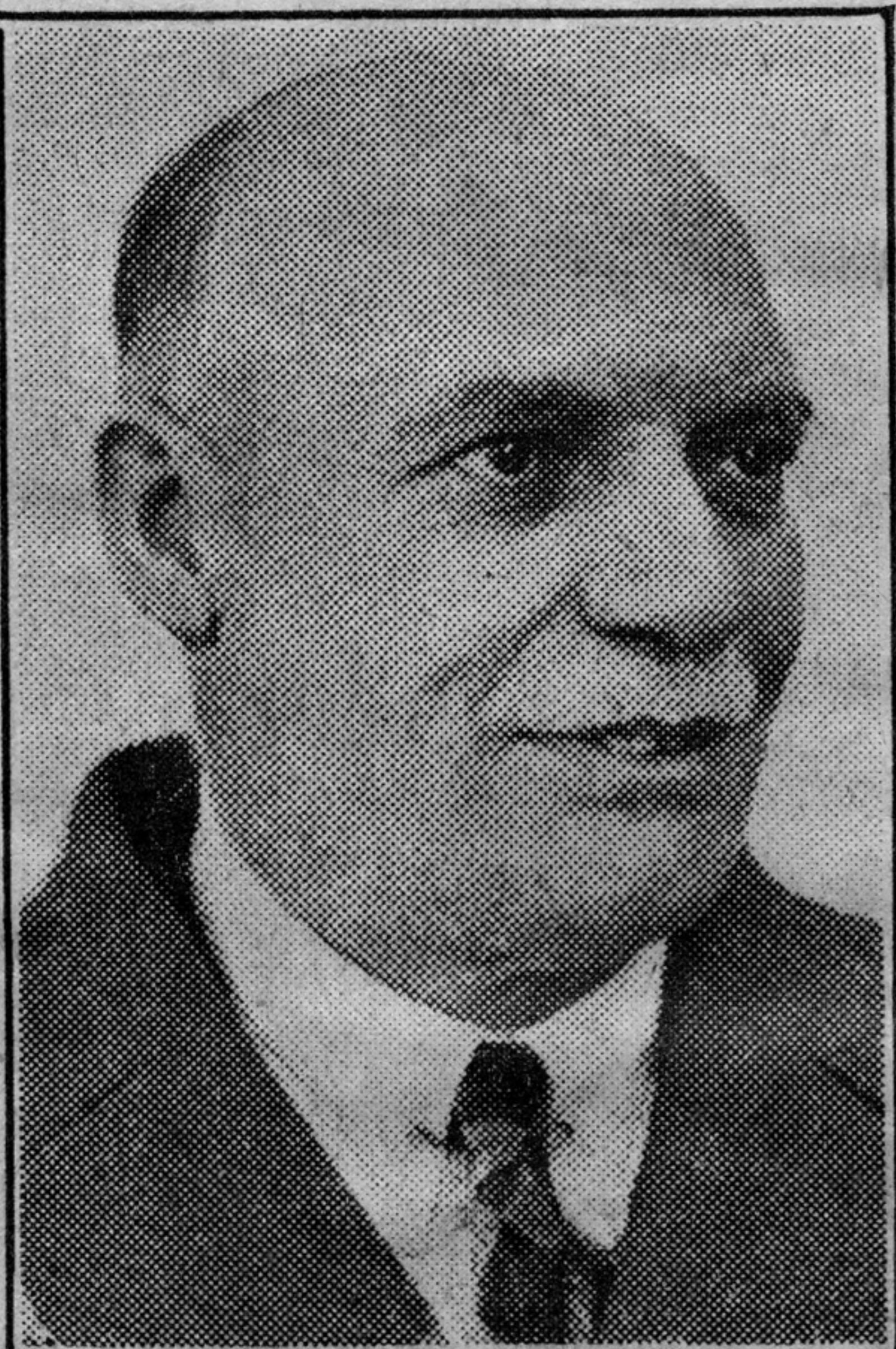
Senator F. S. Malan (Cape Province)