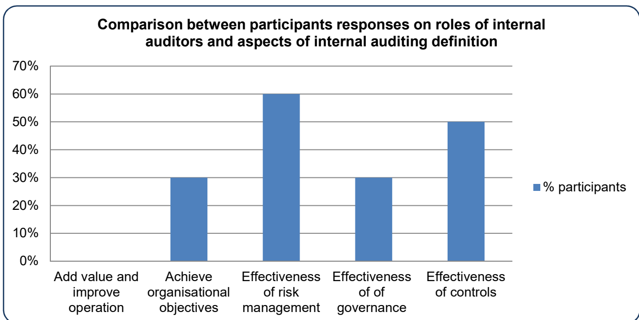
Figure 3: Summary of participants’ responses on roles and responsibilities: aspects of internal auditing definition

Study participants’ responses in relation to key aspects of the IIA’s definition of internal auditing were analysed and are presented in Figure 3 below.