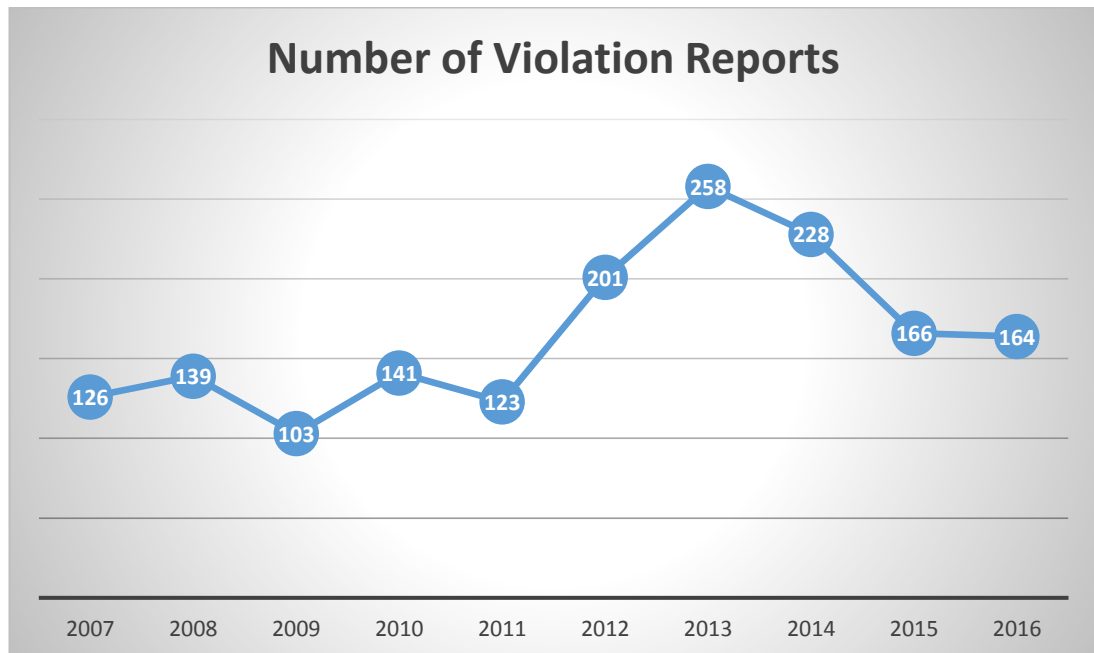
Figure 1: Number of Violation Reports

One further development since 2012 is the introduction of a comprehensive whistleblowing system to help provide early detection of violations of the code of conduct of employees. Currently, reports on the violation of the DGT code of conduct can be submitted in a variety of relatively easy and accessible ways, including through Help Desks and Call Centres, on a dedicated whistleblowing telephone hotline, and by fax, email and written letter. The number of violations reported in the period 2007 to 2016 is reported in Figure 1. It is interesting to note the spike in reports in the two years immediately following 2011, around the period when the Gayus case was receiving intense media publicity.